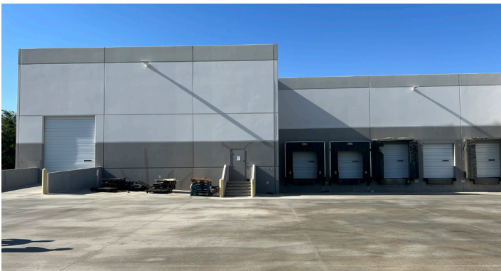
One grade-level door. Two dock doors