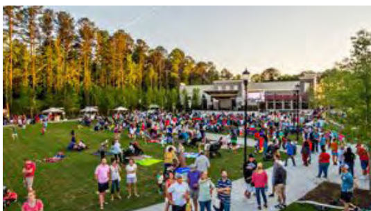
2. Peachtree Corners • 16 Min Drive 2,300 businesses in a regional setting