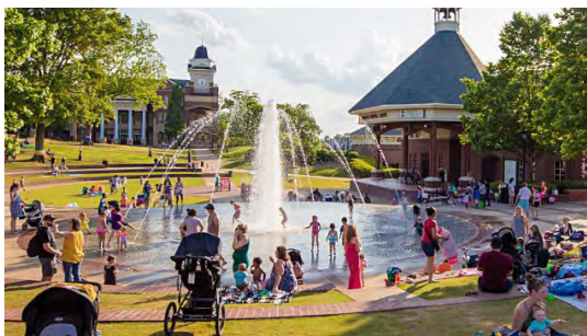
1. Downtown Duluth • 8 Min Drive 40+ Stores in a walkable downtown