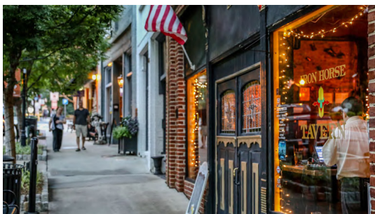
3. Downtown Norcross • 15 Min Drive 52 Stores in a walkable downtown