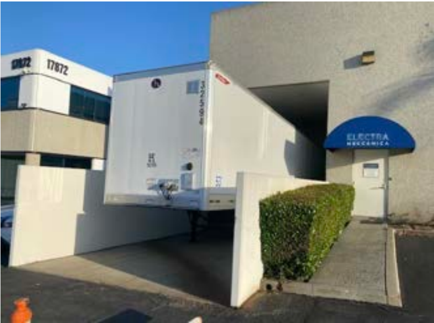
53 foot trailer being unloaded.