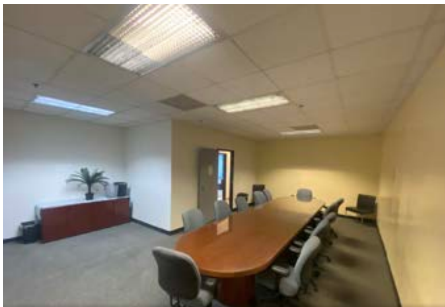
Conference room with 12 seat Rosewood table.