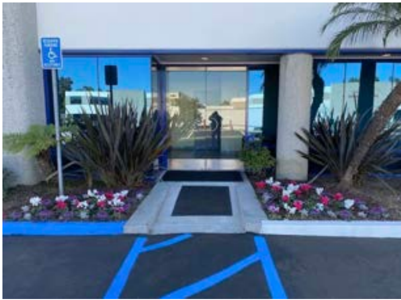
Elegant front entrance