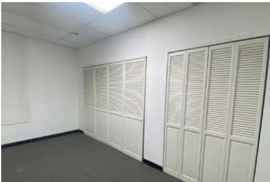
Private office with accordion door access to internet data and phone lines, adjacent to main electrical panel, generator panel, fire sprinkler riser pipe, fire alarm panel and burglar alarm panel.