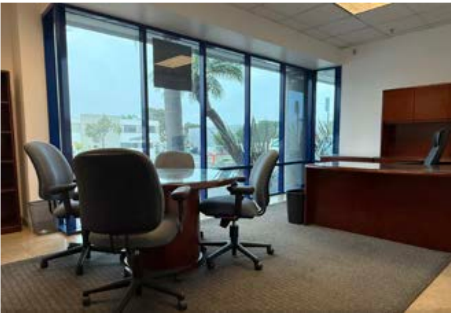
Sound proof Executive office with expensive marble and high grade carpet.