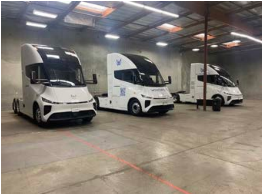
All electric giant trailer tractors research center.