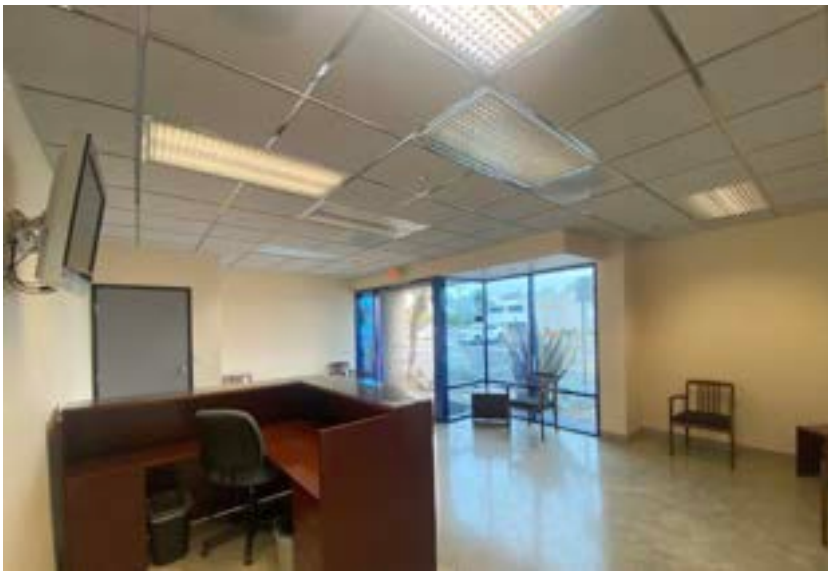
Marble floor lobby with Rosewood furniture