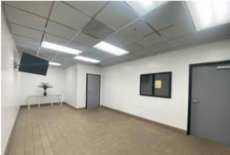
Employee lunch room with ceramic tile floors and training television.