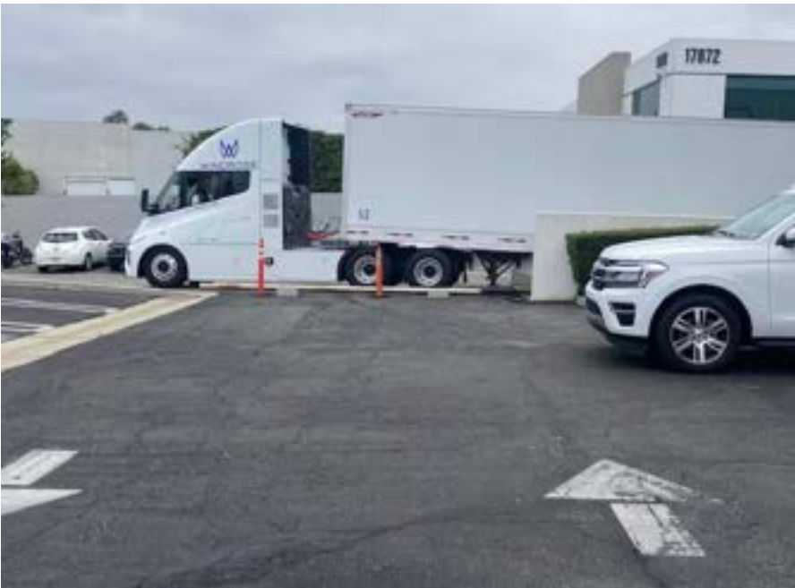
53 foot trailer entering truck well.