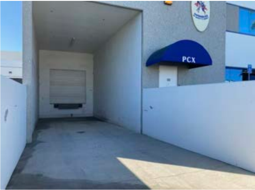
Covered truck well with lights perfect for nighttime or rainy weather loading and unloading.