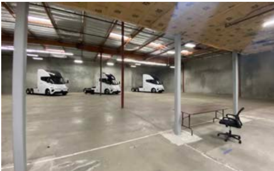
World first all electric research and development facility