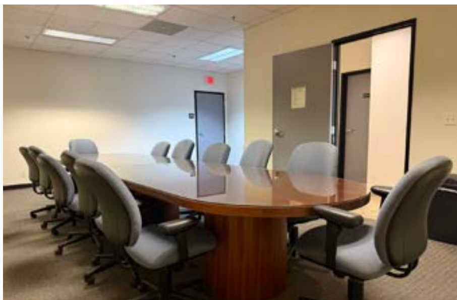
Elegant conference room with 12 seat Rosewood table.