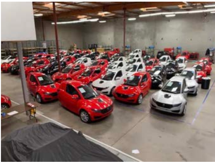
Automotive research and development lab with 80 car storage.