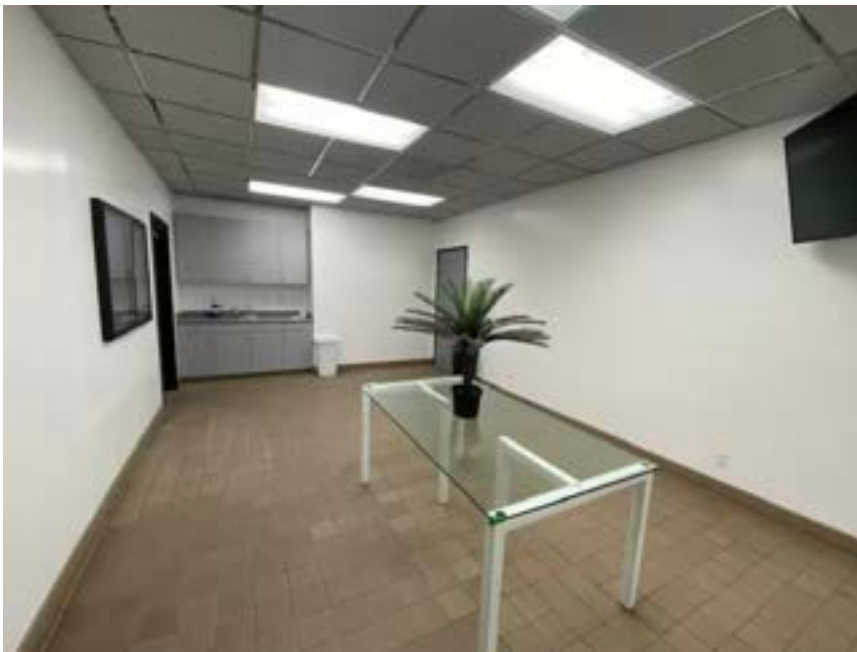
Employee lunch room and training center with wet bar.