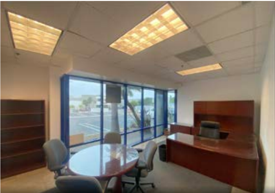
Floor to ceiling tinted windows allowing for full view of entrance and parking lot.