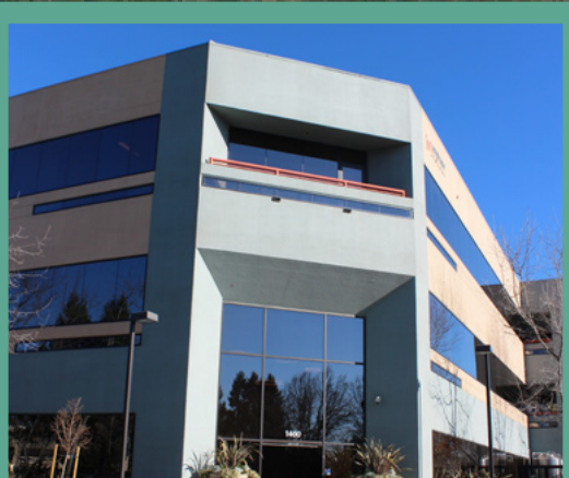
1400 N McDowell Blvd