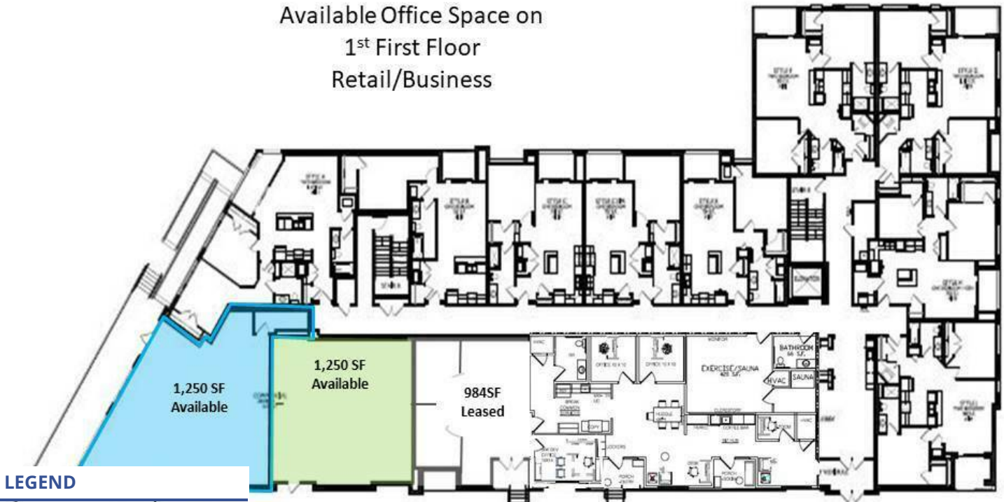
Available Office Space on 1 st First Floor Retail/Business