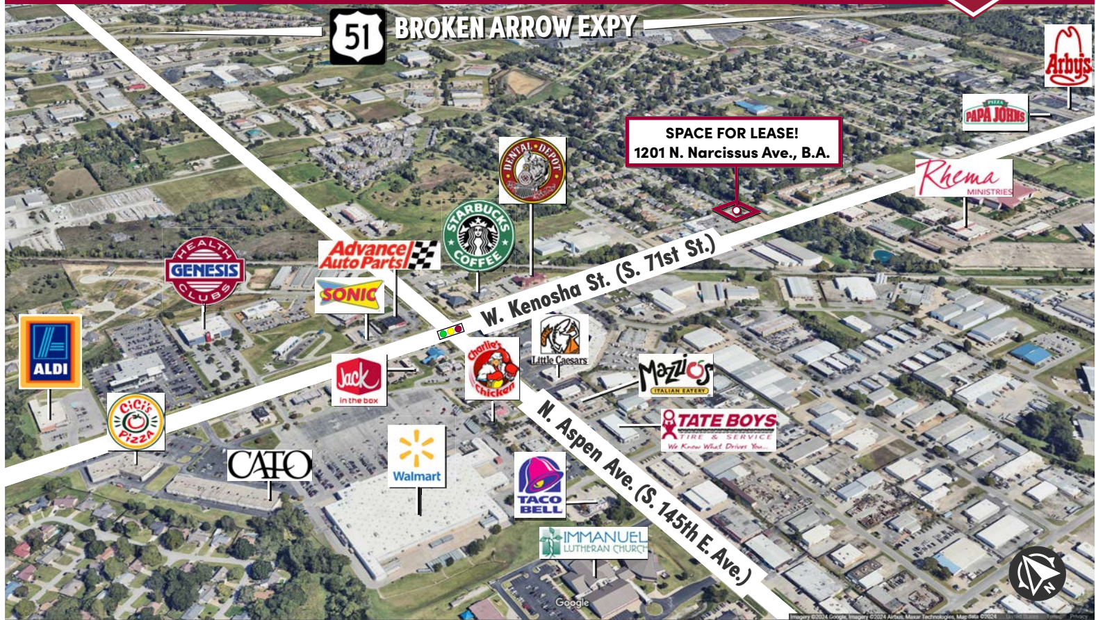
Greater Tulsa Area Map