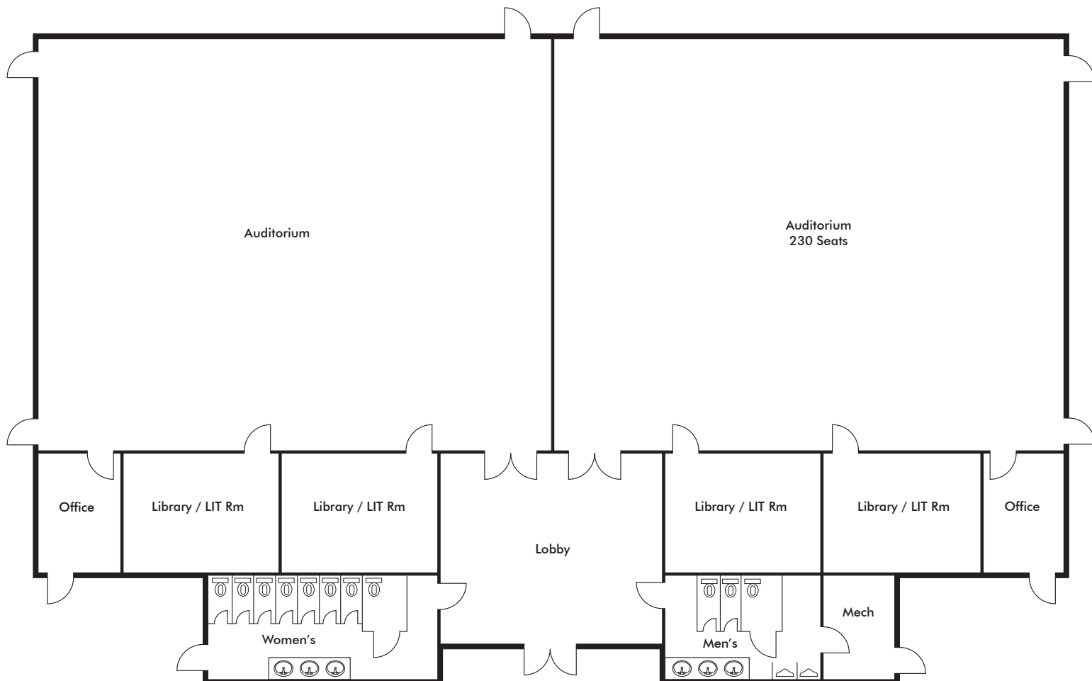
PORTERVILLE - FLOOR PLAN