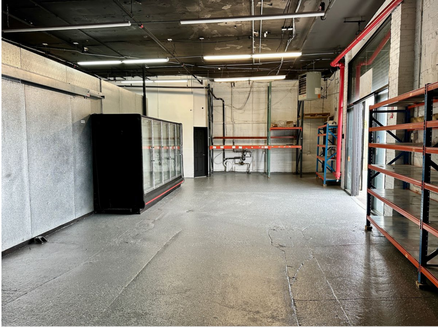
Main floor — overhead door entry · Pallet racking · Cold room wall visible