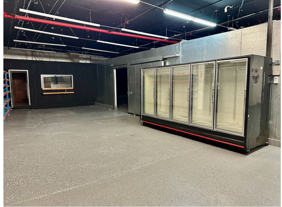
Second angle — glass-door display cases + walk-in cold room entry