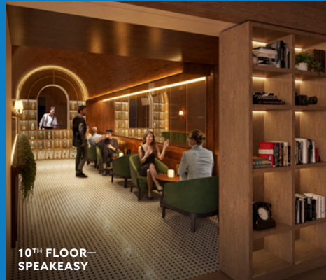
10 TH FLOOR— SPEAKEASY