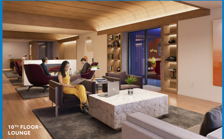
10 TH FLOOR— LOUNGE