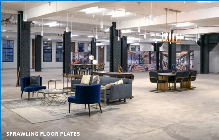
SPRAWLING FLOOR PLATES