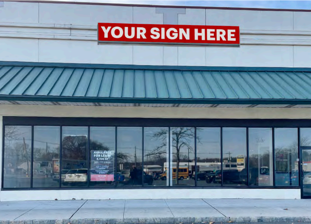
SPACE 2 - 5,705 SF