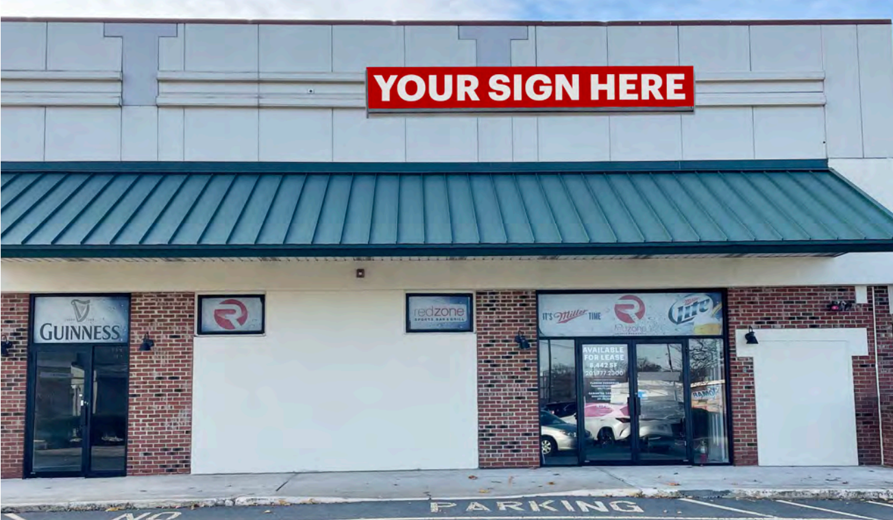
SPACE 1A (ENTERTAINMENT / EVENT / RESTAURANT SPACE) - 8,422 SF