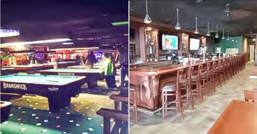
Space 1B - Turnkey Restaurant Space Available