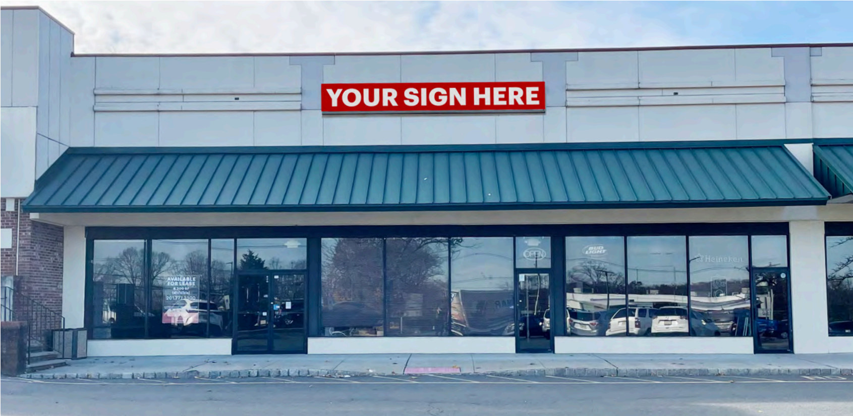
SPACE 1B (FORMER RESTAURANT) - 8,200 SF