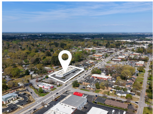
ANDERSON COUNTY TAX MAP #1221208005