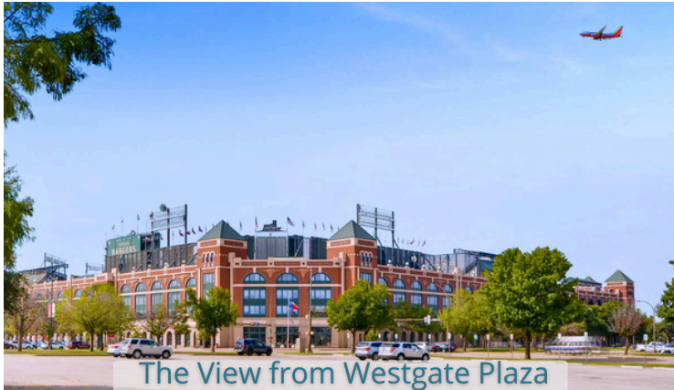
The View from Westgate Plaza