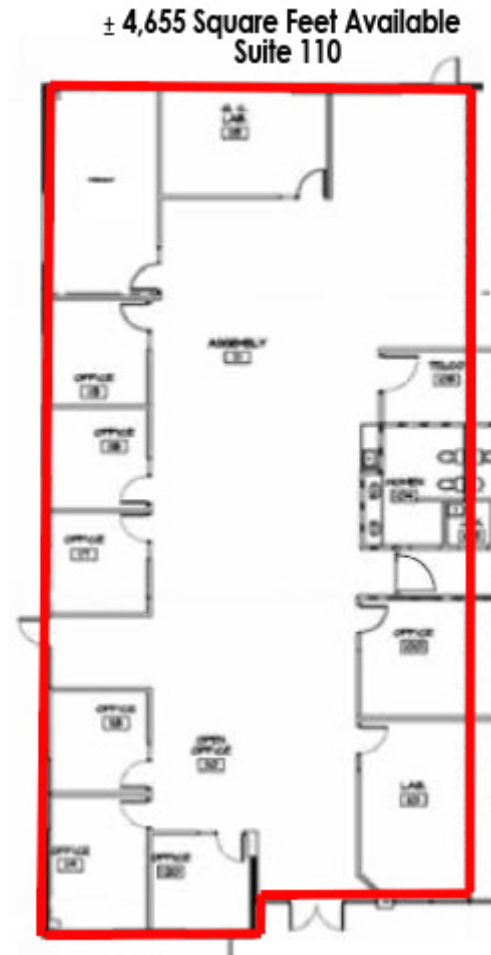
155 E. Main Avenue, Morgan Hill | Floorplan