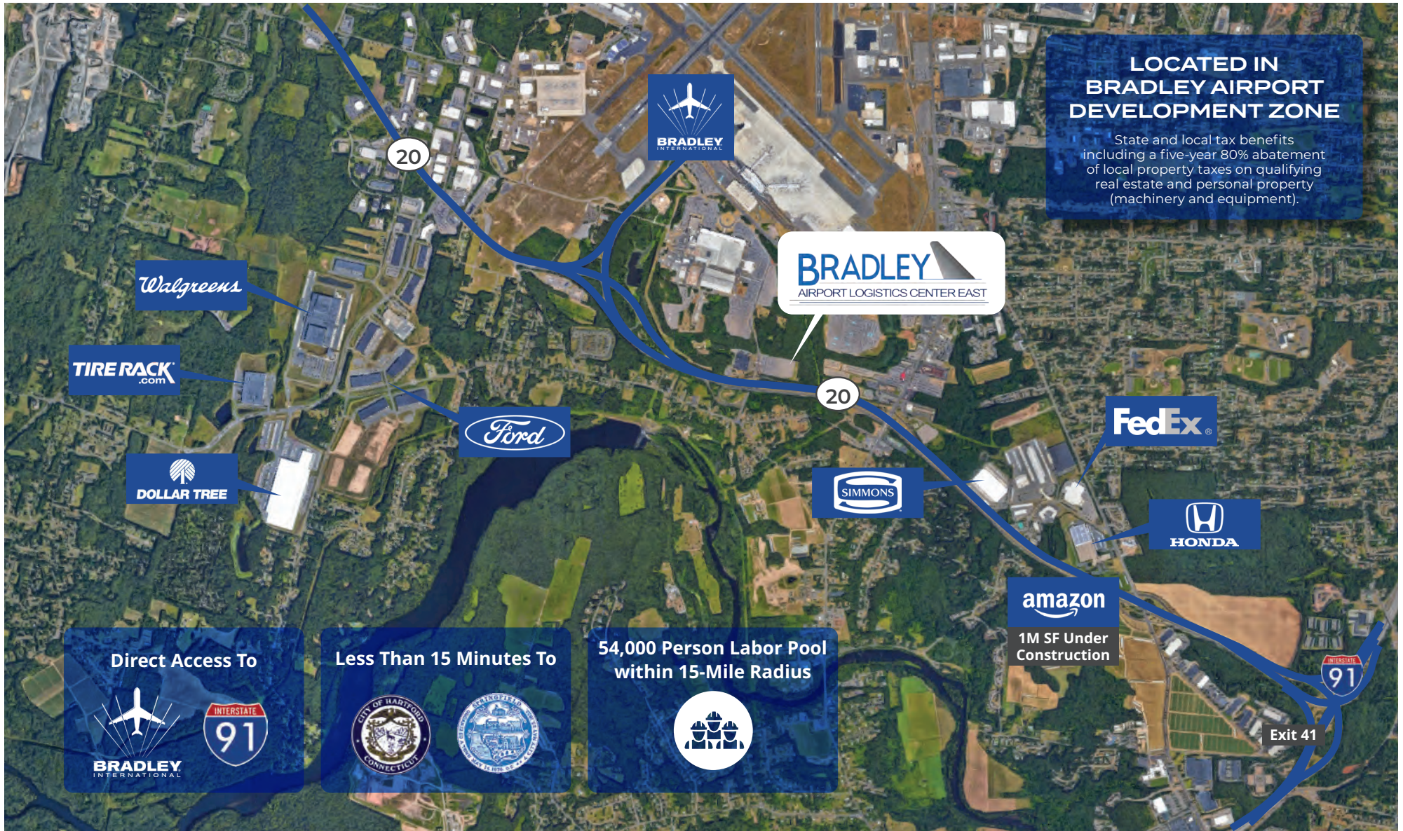
Bradley Airport Logistics Center East