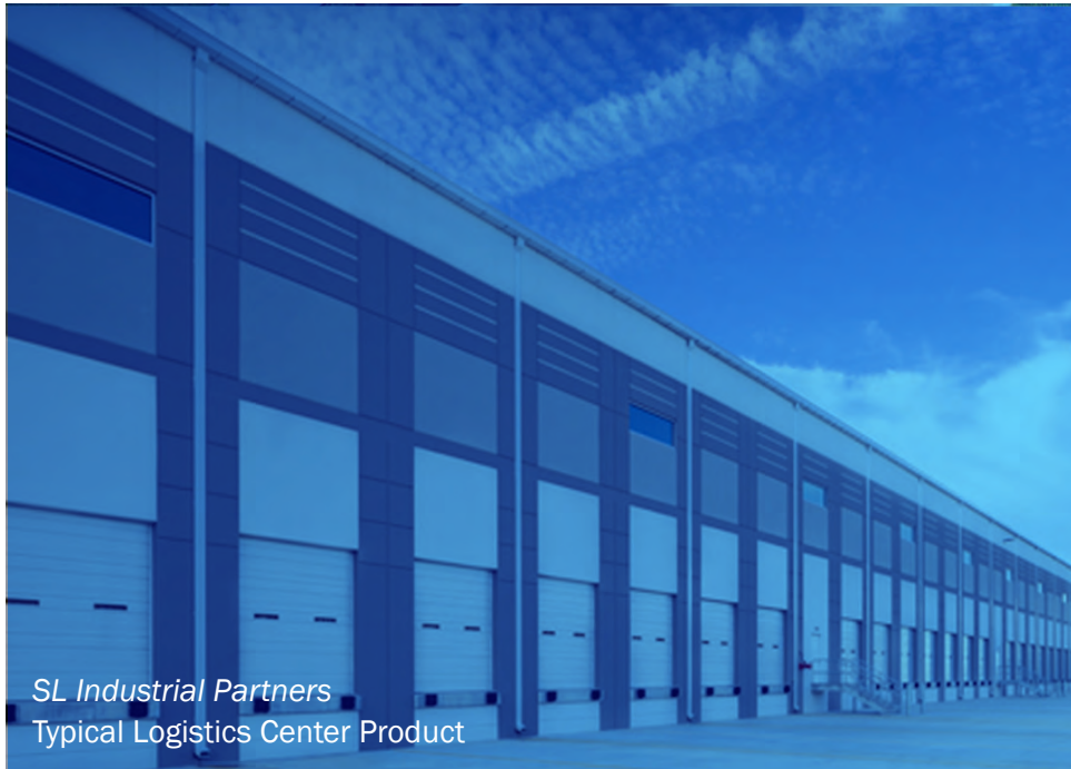
SL Industrial Partners Typical Logistics Center Product