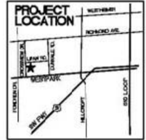
LOCATION MAP NORTH