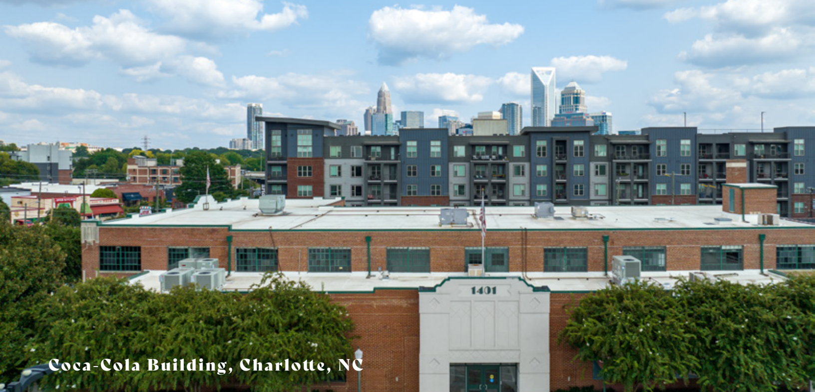
Coca-Cola Building, Charlotte, NC