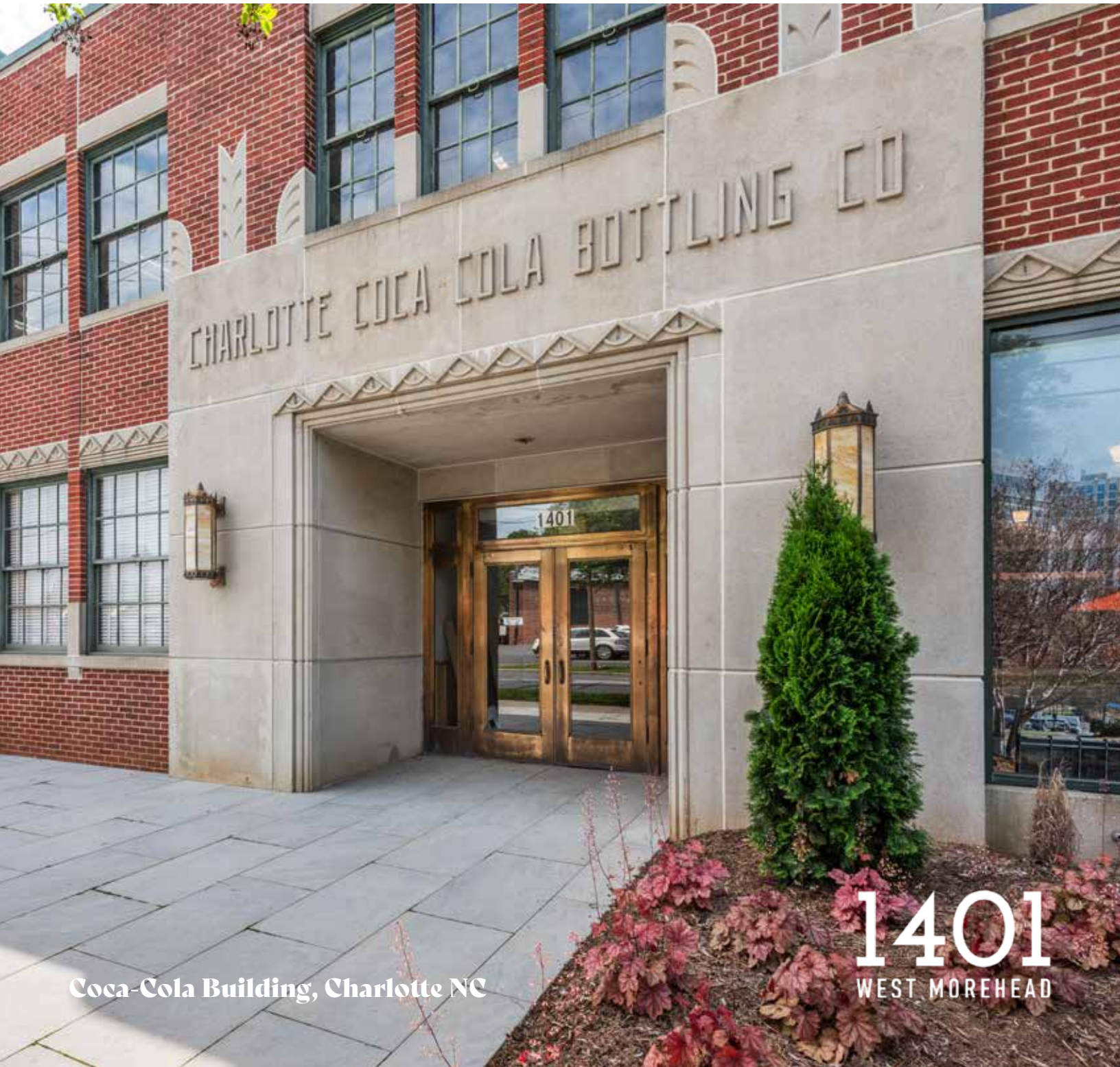
Coca-Cola Building, Charlotte NC