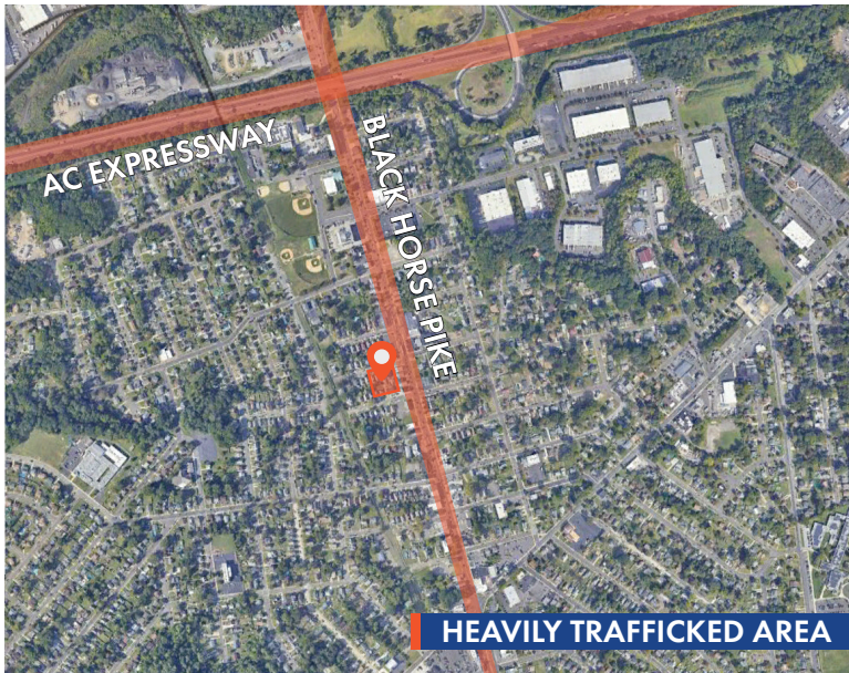
HEAVILY TRAFFICKED AREA