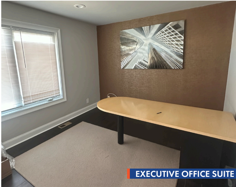
EXECUTIVE OFFICE SUITE