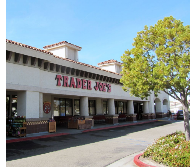
06 – Trader Joe's anchors Phase II of the Center