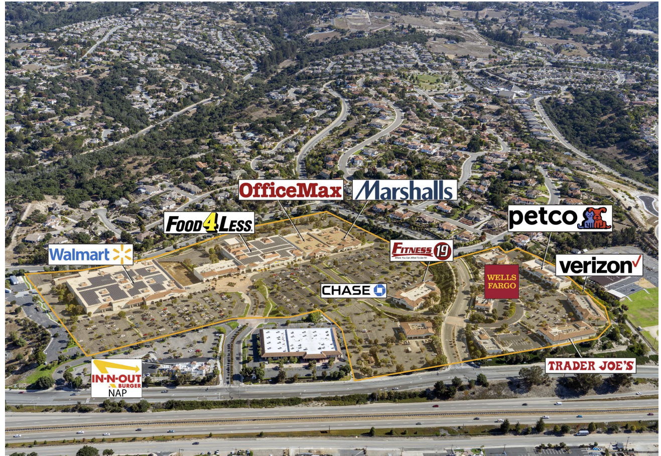
10 – Aerial view of Five Cities Center