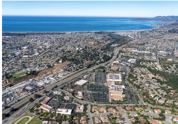
08 – Arroyo Grande Five Cities Center & surrounding area