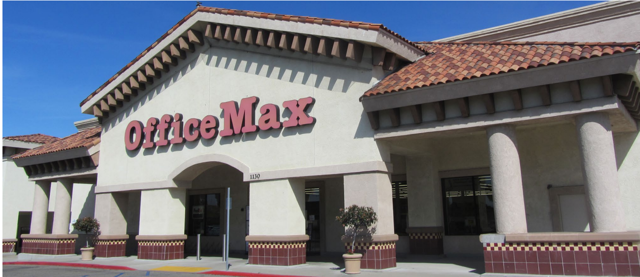
05 – 24,000 SF Current Office Max Frontage