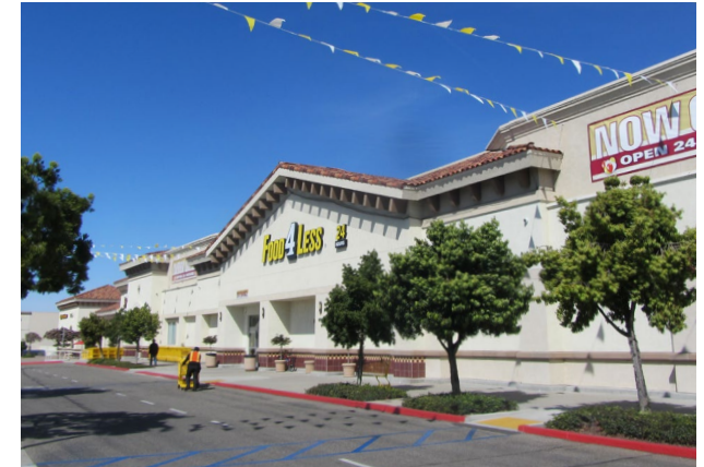
09 – 60,000 SF Food 4 Less