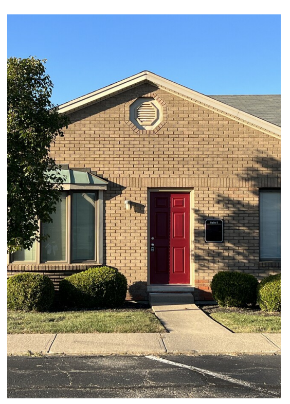
Suites i 7908 Cincinnati Dayton Rd, West Chester, OH 45069