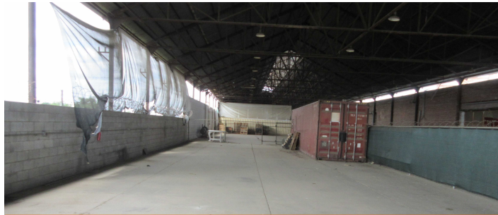
E1 Canopy Aarea