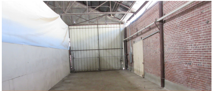
E4 Canopy Area