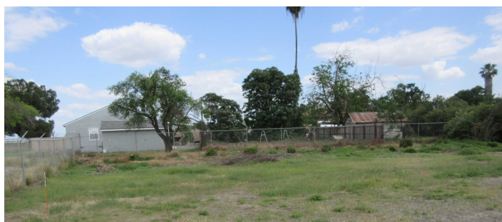
C2D Laydown Area