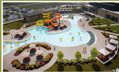
DAN MADDOX $30M+ YMCA