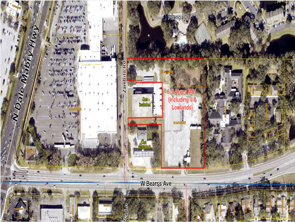
Zambito Area Map