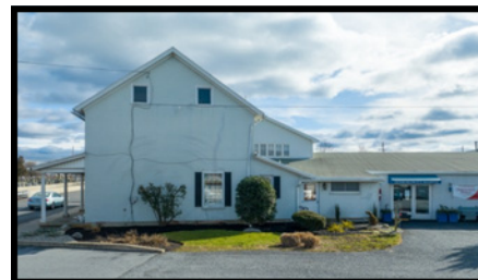
Residential home and Business office