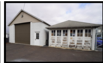
Garage / Work shop