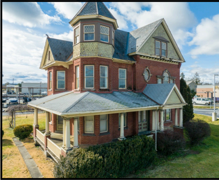
Above: Victorian Building