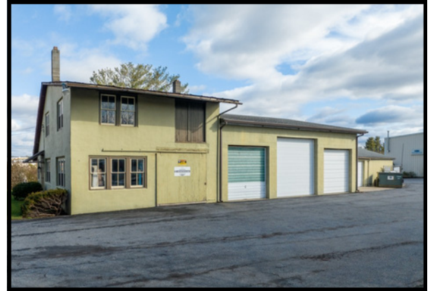
Garages and work shop