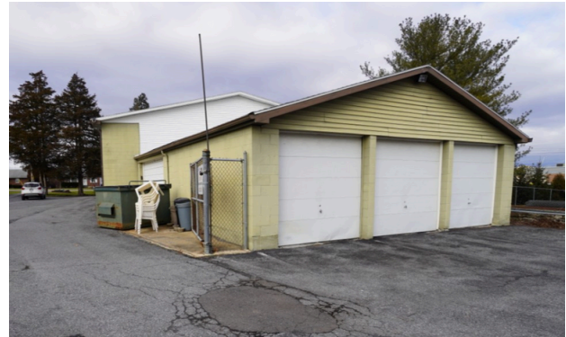
Garages and work shop