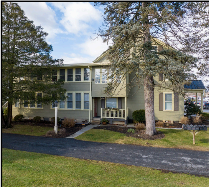
Below: Residential Multi Unit (Income Producing)