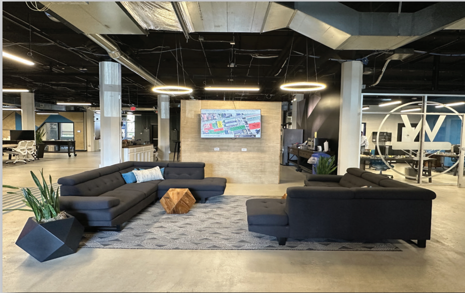
1ST FLOOR - WAITING AREA