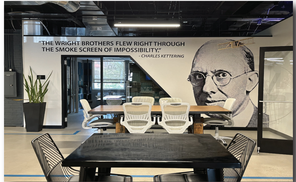
1ST FLOOR - BREAK AREA