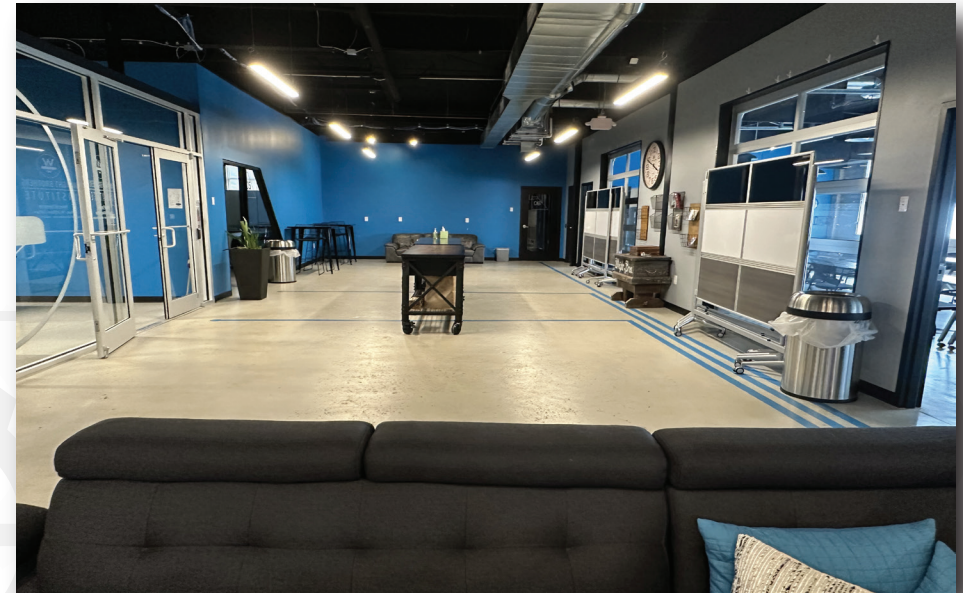
1ST FLOOR - OPEN SPACE