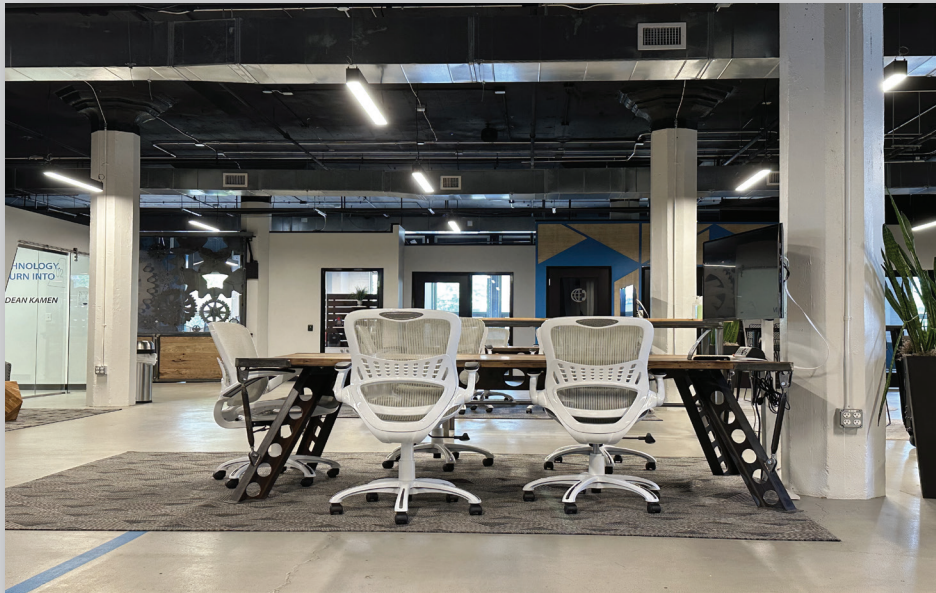
1ST FLOOR - OPEN SPACE