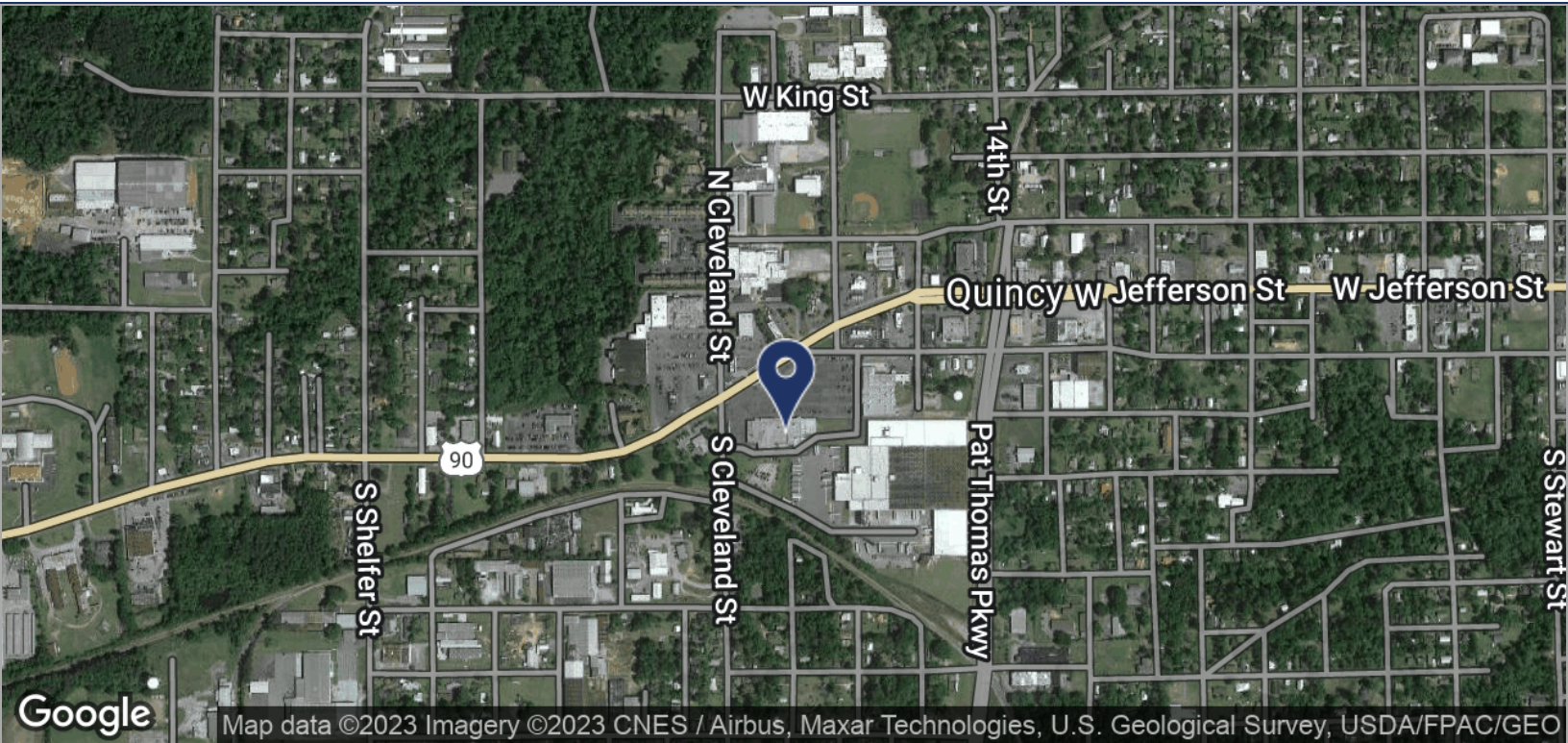
Map data ©2023 Imagery ©2023 CNES / Airbus, Maxar Technologies, U.S. Geological Survey, USDA/FPAC/GEO

1509 W JEFFERSON STREET, QUINCY, FL 32351