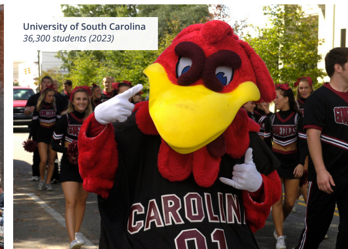
University of South Carolina 36,300 students (2023)