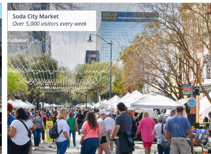
Soda City Market Over 5,000 visitors every week