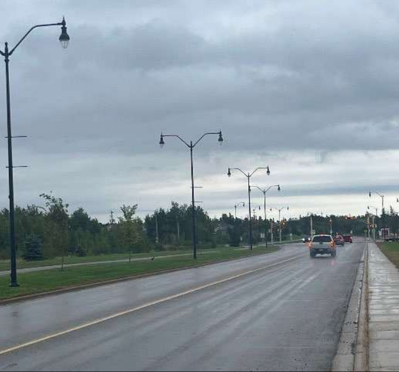
Street Scene – West along Gunningsville Blvd

Prime Retail, Hotel, Apartment Development Opportunity