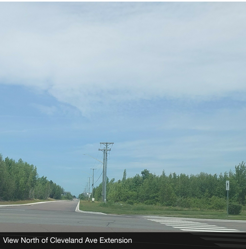
View North of Cleveland Ave Extension