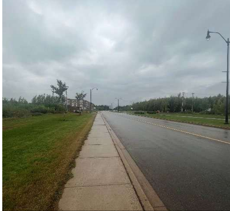
Street Scene – East along Gunningsville Blvd