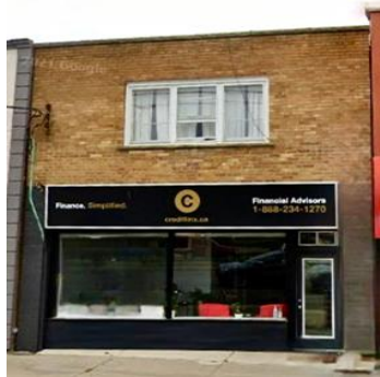
2839 Kingston Rd