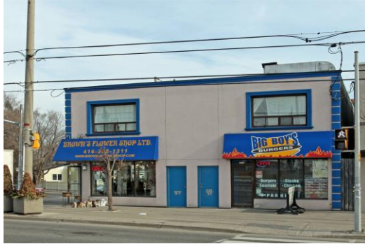
2851 Kingston Rd