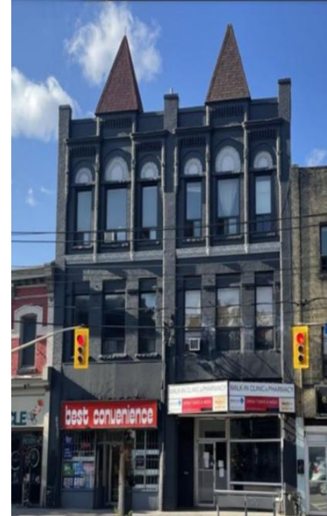
1408-1410 Queen St W