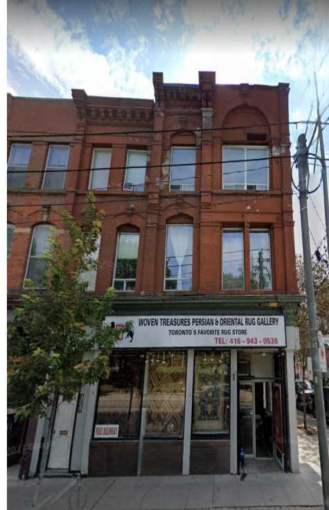
167-169 Queen St E