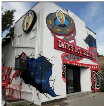
1130 Queen St E