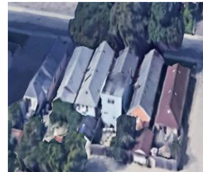
645-655 Northcliffe Blvd