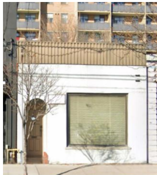
3108 Danforth Ave