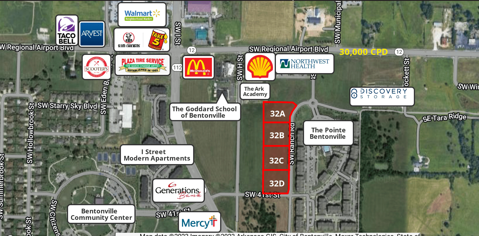
Map data ©2023 Imagery ©2023 Arkansas GIS, City of Bentonville, Maxar Technologies, State of