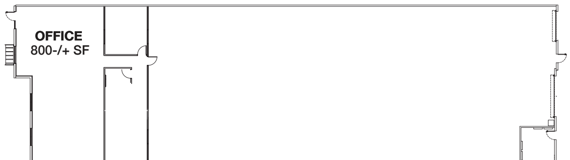
SUITE B-2 10,001 SF Total

Equity Real Estate | 321 E State St, American Fork, UT 84003