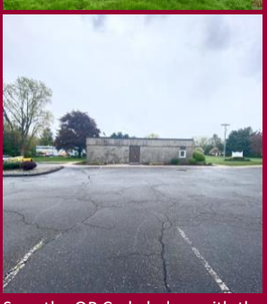
Scan the QR Code below with the camera on your smart phone to access our website.