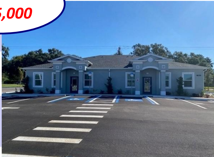
Office Building Front Elevation

730 Cactus Ridge Circle, Seffner, Florida 33584