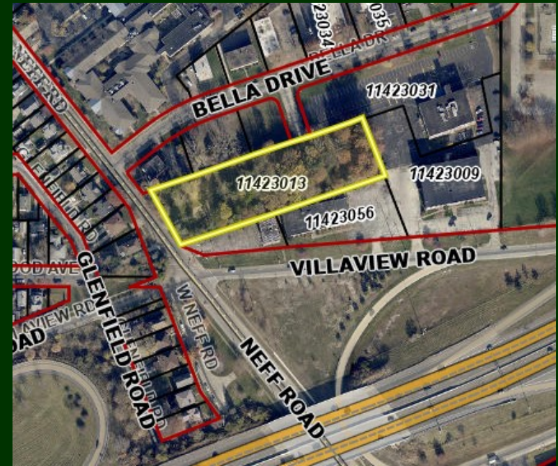
18805 Neff Rd., Cleveland, OH 44119

No warranty or representation, express or implied, is made as to the accuracy of the information contained herein. It is submitted subject to errors, omissions, price changes, rental or other conditions, withdrawal without notice, and to any special listing conditions imposed by our client.