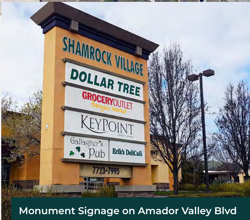
Monument Signage on Amador Valley Blvd