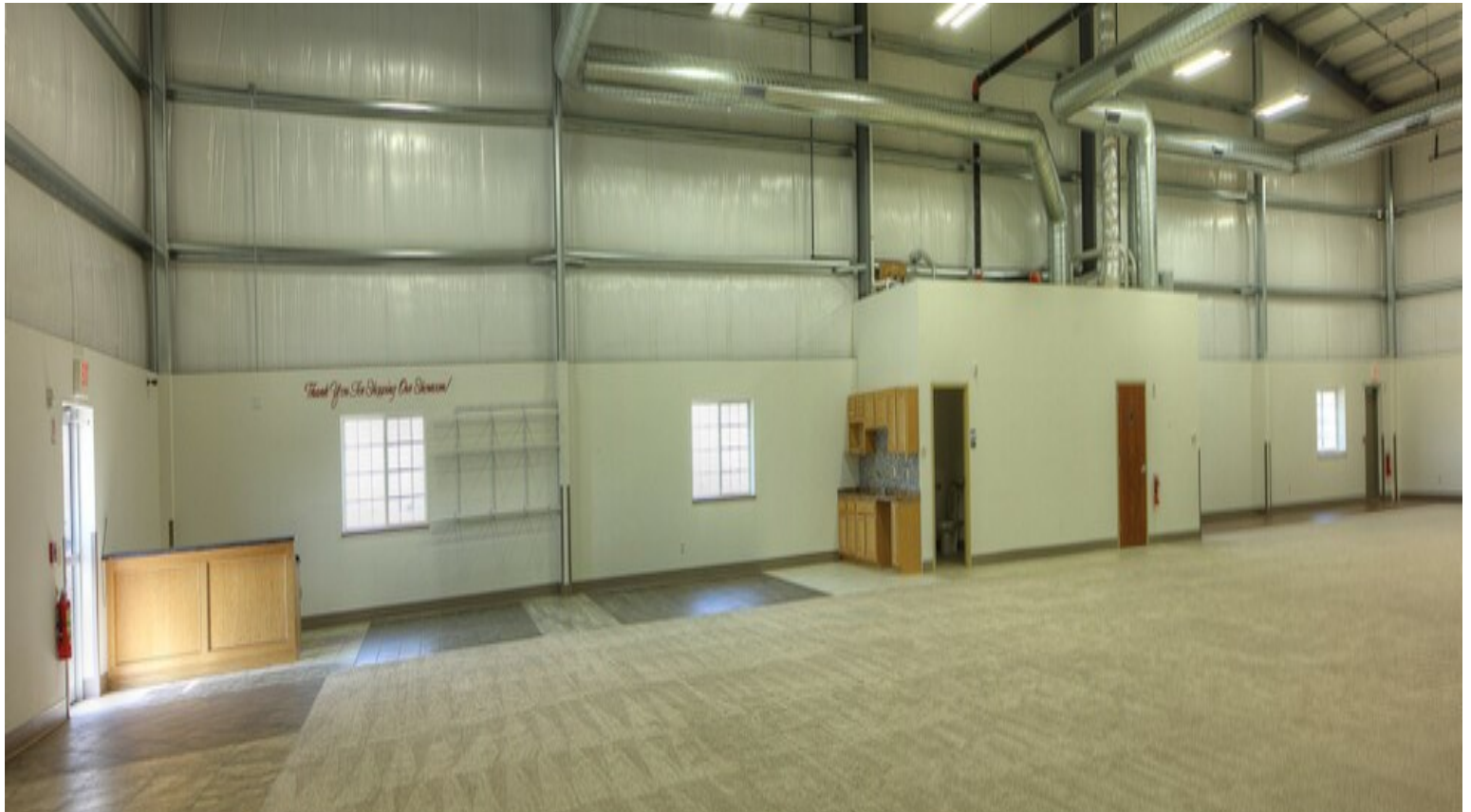
Reception desk, coffee bar, restroom, sprinkler room, and utility room