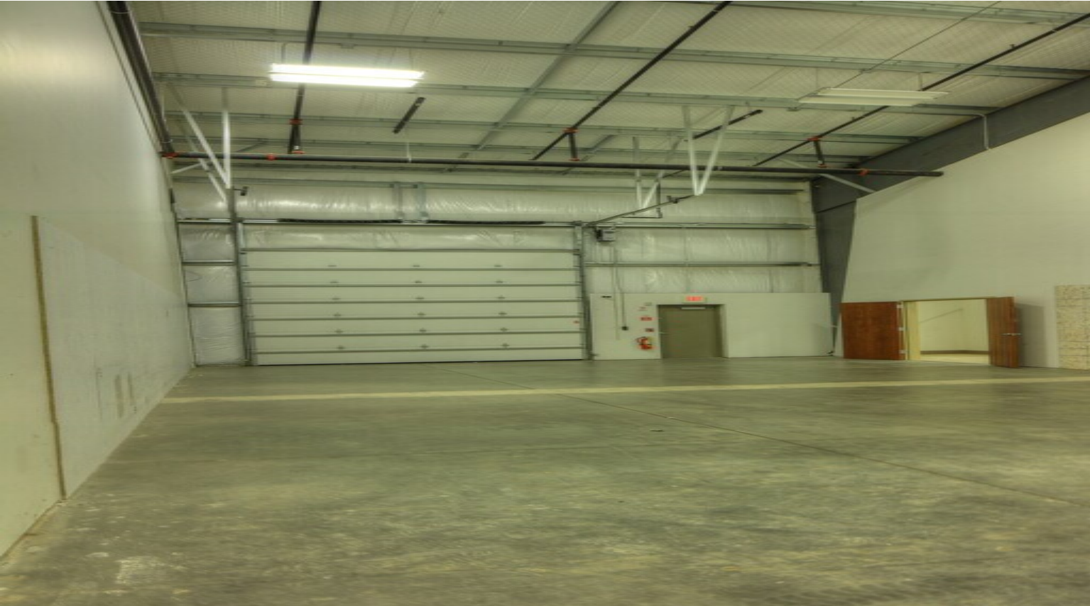
1,500 SF warehouse space