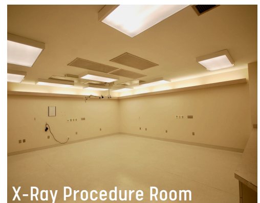
X-Ray Procedure Room