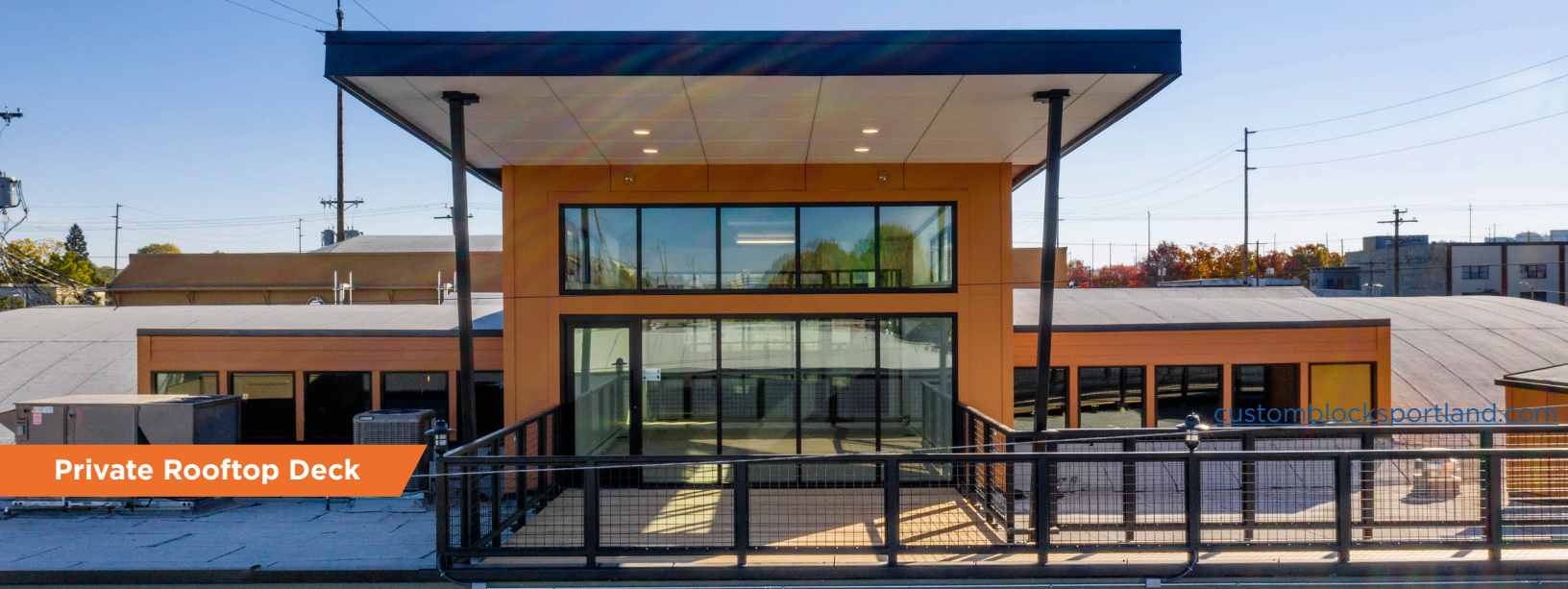
Private Rooftop Deck