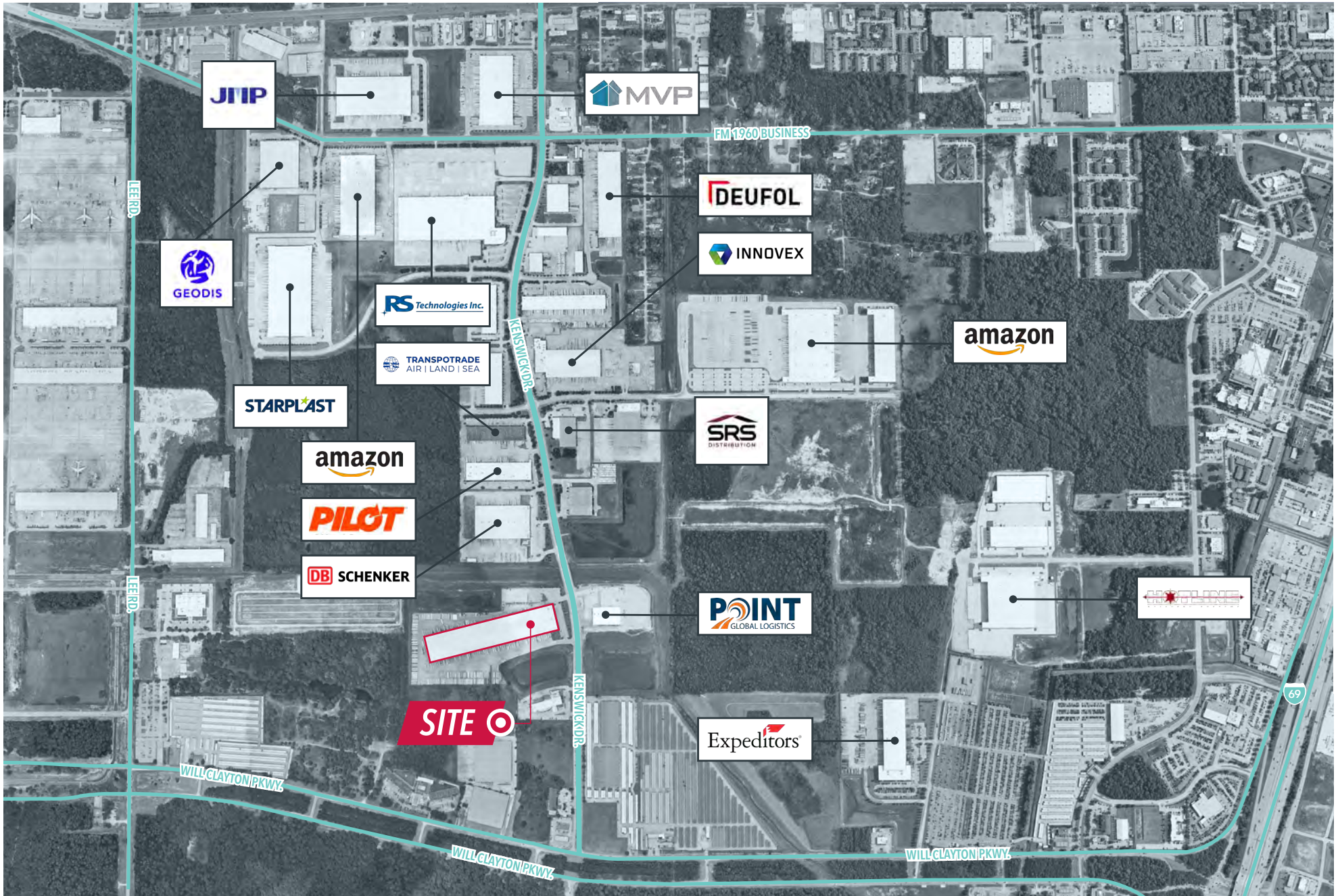
LOCATION & NEIGHBORING TENANTS