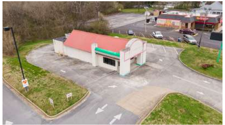
Lafayettedrone (13 of 20)