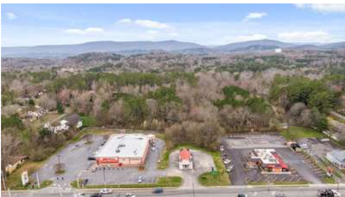
Lafayette drone (1 of 20)