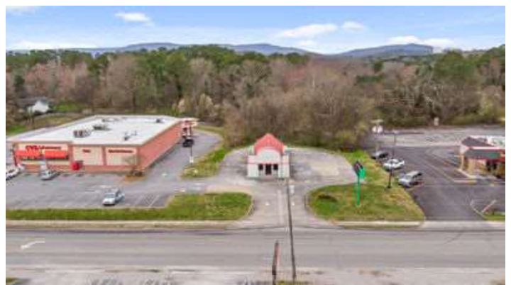
Lafayettedrone (15 of 20)