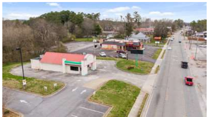
Lafayettedrone (14 of 20)