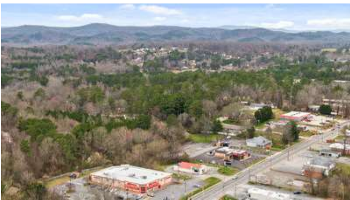
Lafayettedrone (10 of 20)