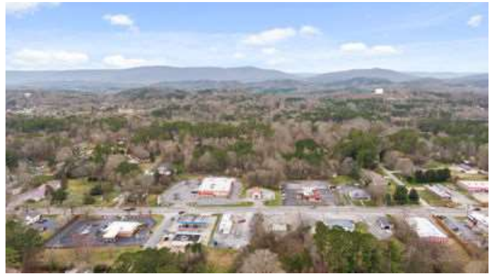
Lafayette drone (4 of 20)