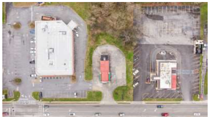
Lafayette drone (6 of 20)