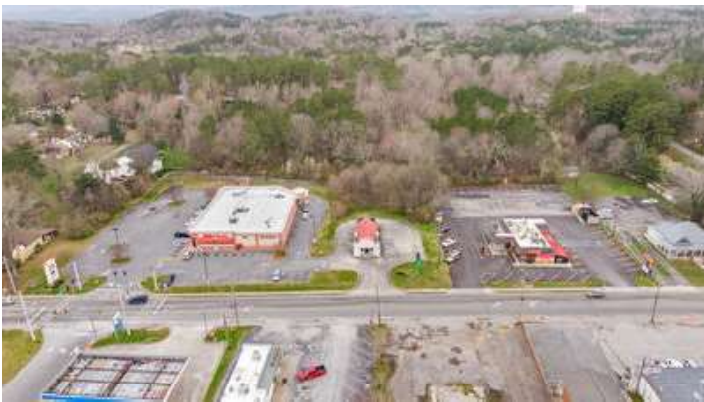
Lafayette drone (2 of 20)