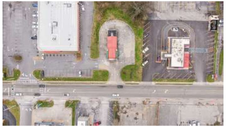
Lafayette drone (5 of 20)