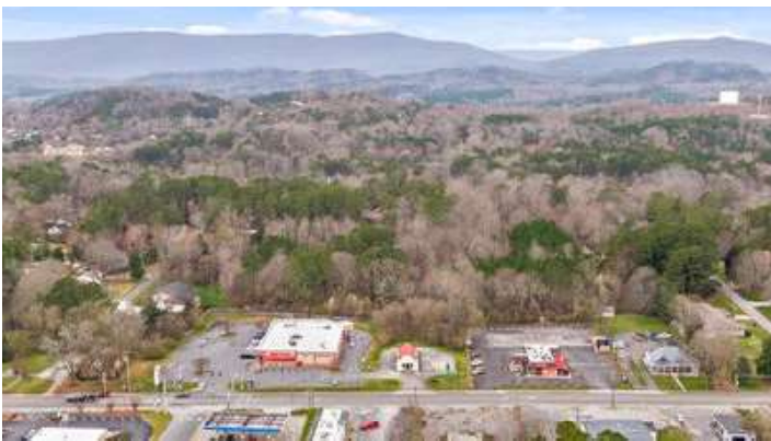
Lafayette drone (3 of 20)