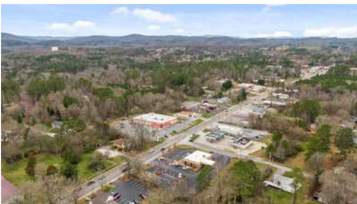
Lafayettedrone (11 of 20)