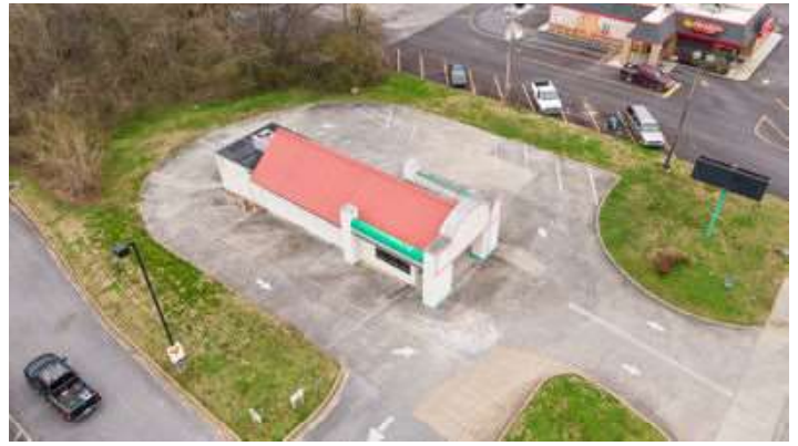
Lafayettedrone (12 of 20)