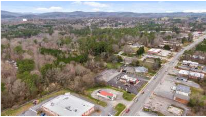
Lafayettedrone (8 of 20)