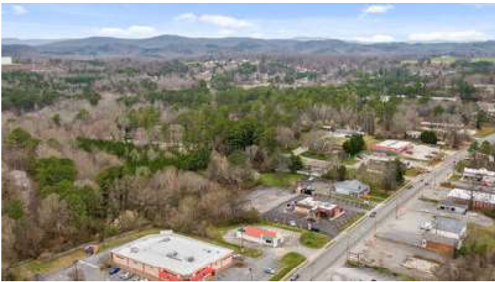
Lafayettedrone (9 of 20)