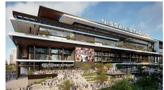
4 The New Nissan Stadium - 1.5 Miles