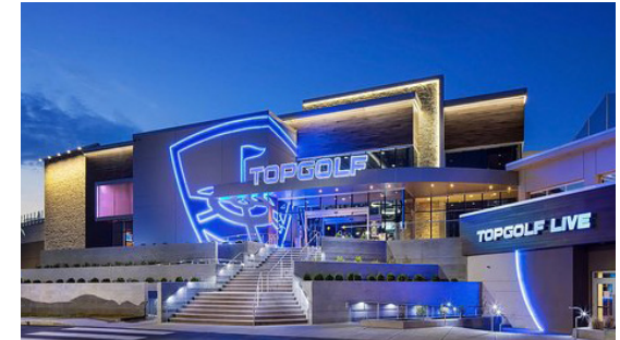
2 TopGolf - 0.7 Miles