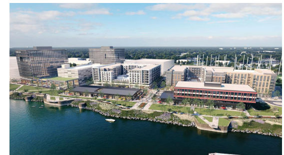
4 River North Development - 1.1 Miles