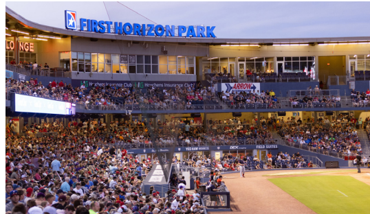
1 First Horizon Park - 0.3 Miles