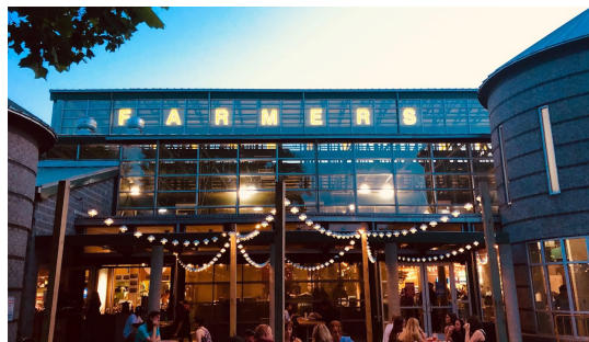
5 Nashville's Farmer's Market - 0.8 Miles