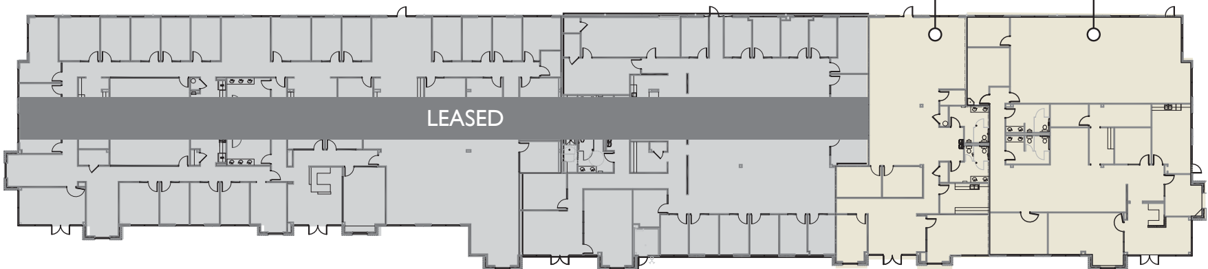
SUITES 250 & 265 ARE CONTIGUOUS FOR A TOTAL OF 8,969 RSF