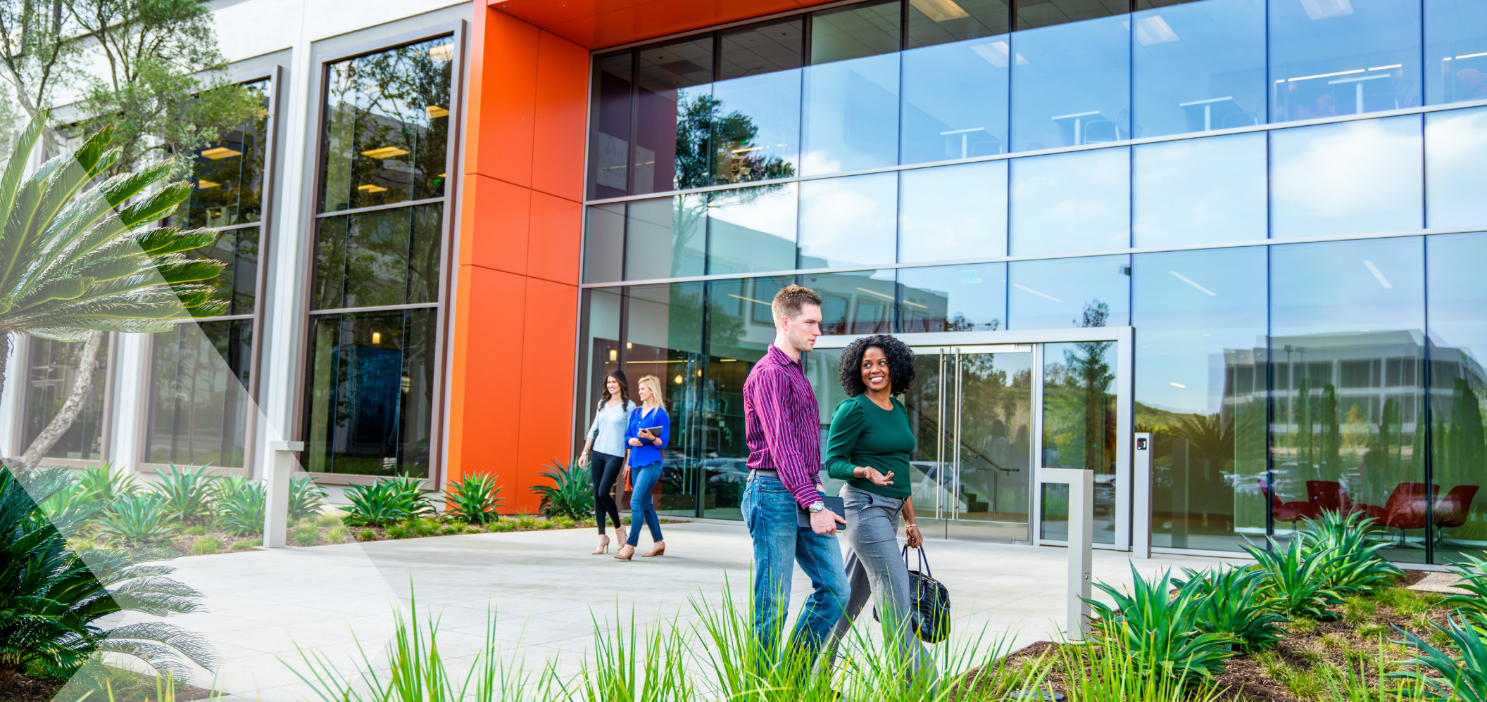
Brand exposure and visibility with building top and monument signage opportunities