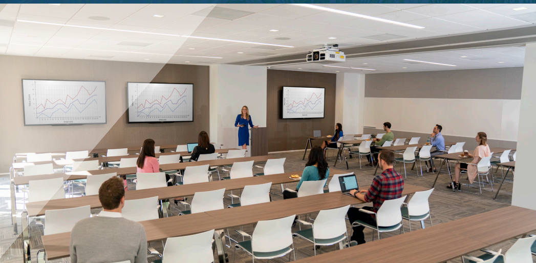
Dynamic conference center with flexible seating and hi-tech AV equipment