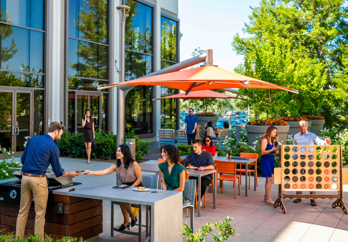
The Commons at UCI Research Park's connected outdoor workspace and gathering areas