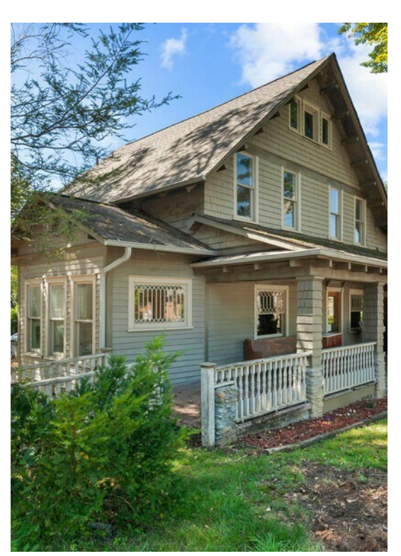
99 Walnut St 99 Walnut St, Waynesville, NC 28786