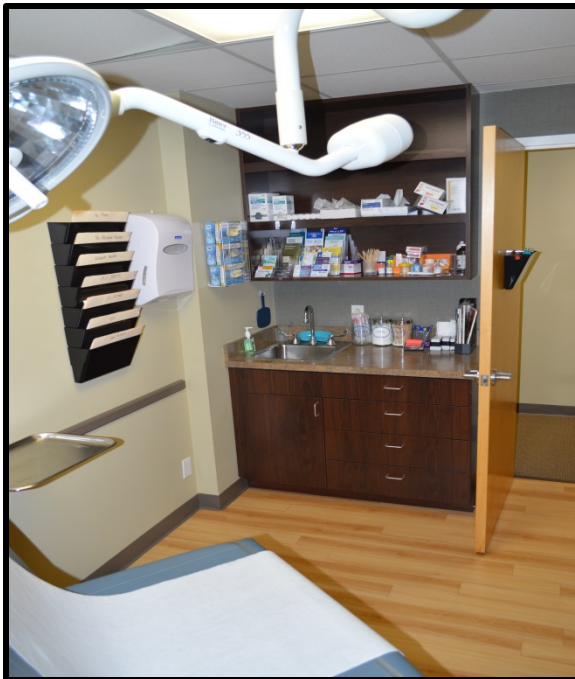
MULTIPLE EXAM ROOMS