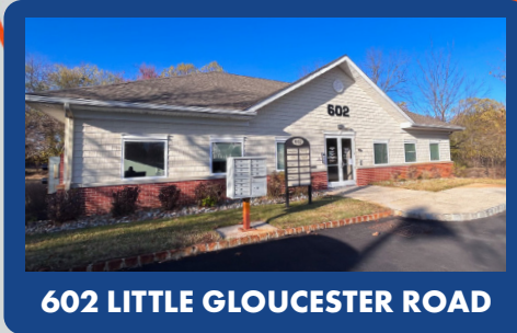
602 LITTLE GLOUCESTER ROAD