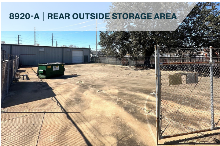
8920-A | REAR OUTSIDE STORAGE AREA