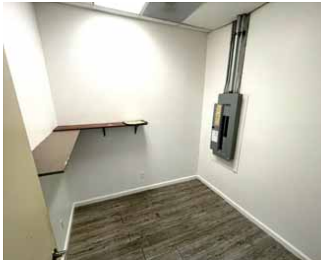
2817 El Camino Real - Interior