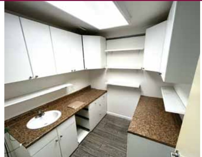
2817 El Camino Real - Interior