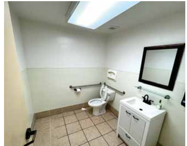
2817 El Camino Real - Interior