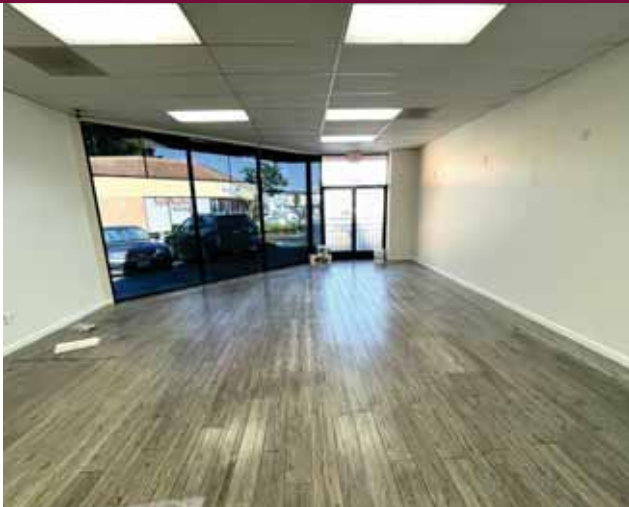
2817 El Camino Real - Interior