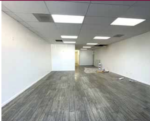
2817 El Camino Real - Interior