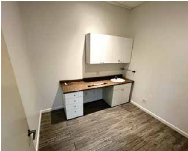
2817 El Camino Real - Interior