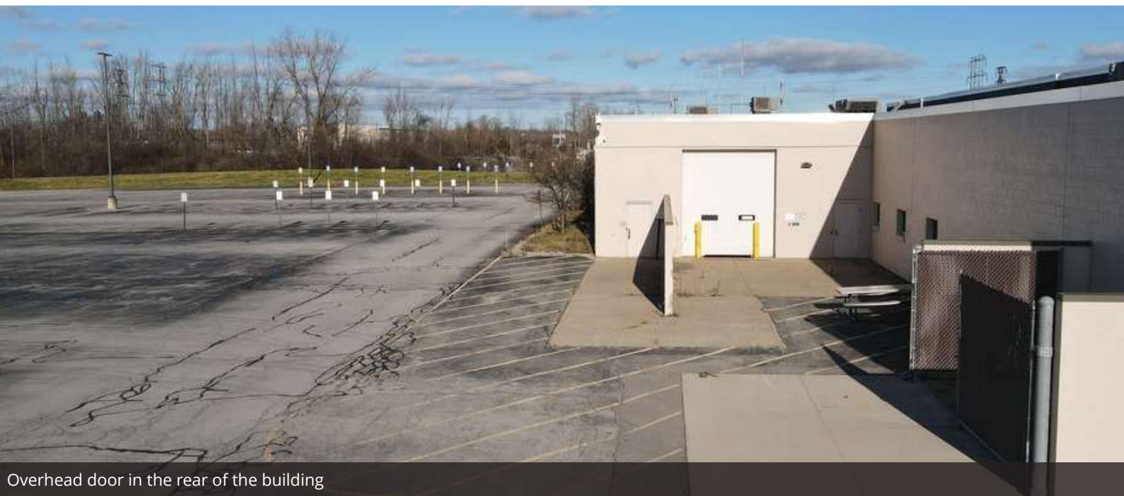
Overhead door in the rear of the building

Brian Donovan 716.998.2943 | brian@donovanres.com 460 East Ave, Rochester, NY 14607 www.donovanres.com