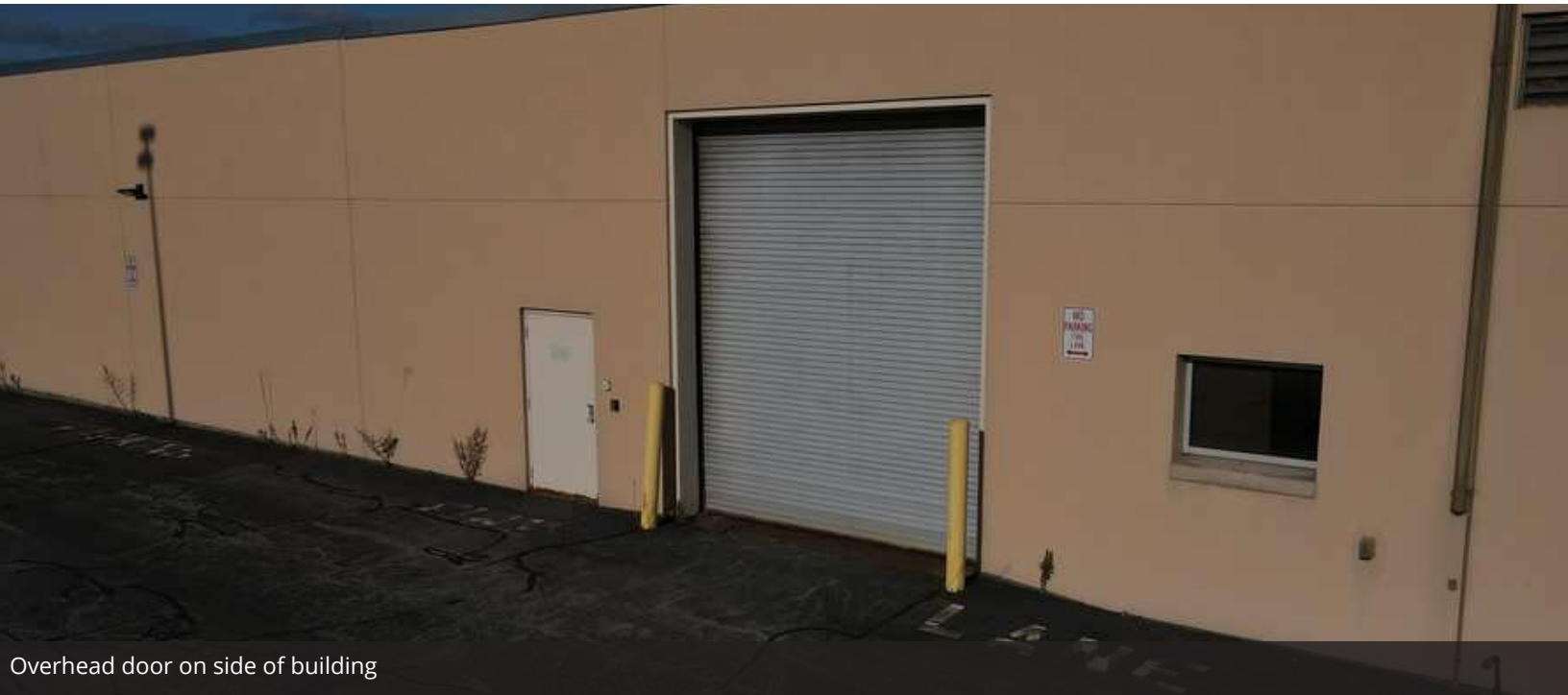
Overhead door on side of building