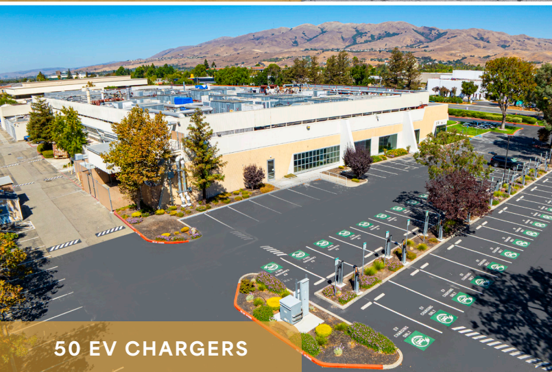
50 EV CHARGERS