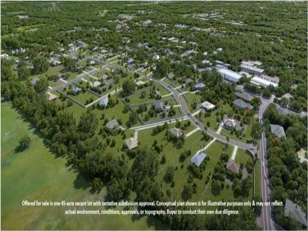
Modeled After Successful Nearby Subdivisions