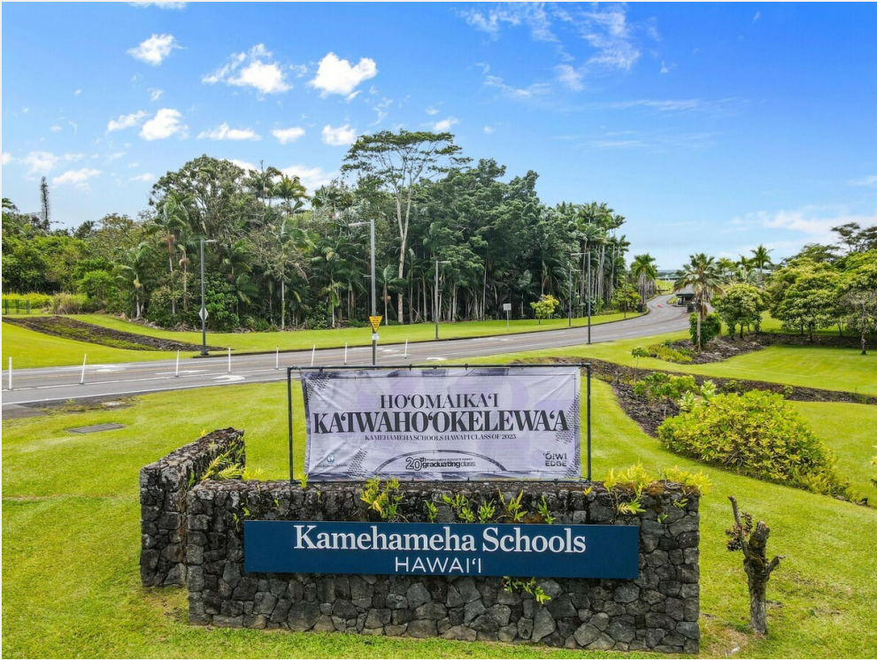
Quiet Outskirts of Hilo