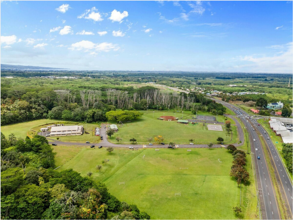
County Water Secured