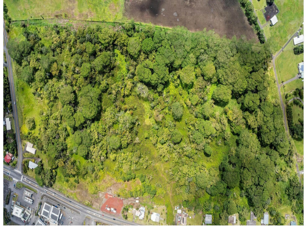
Expansive 45.94-Acre Parcel