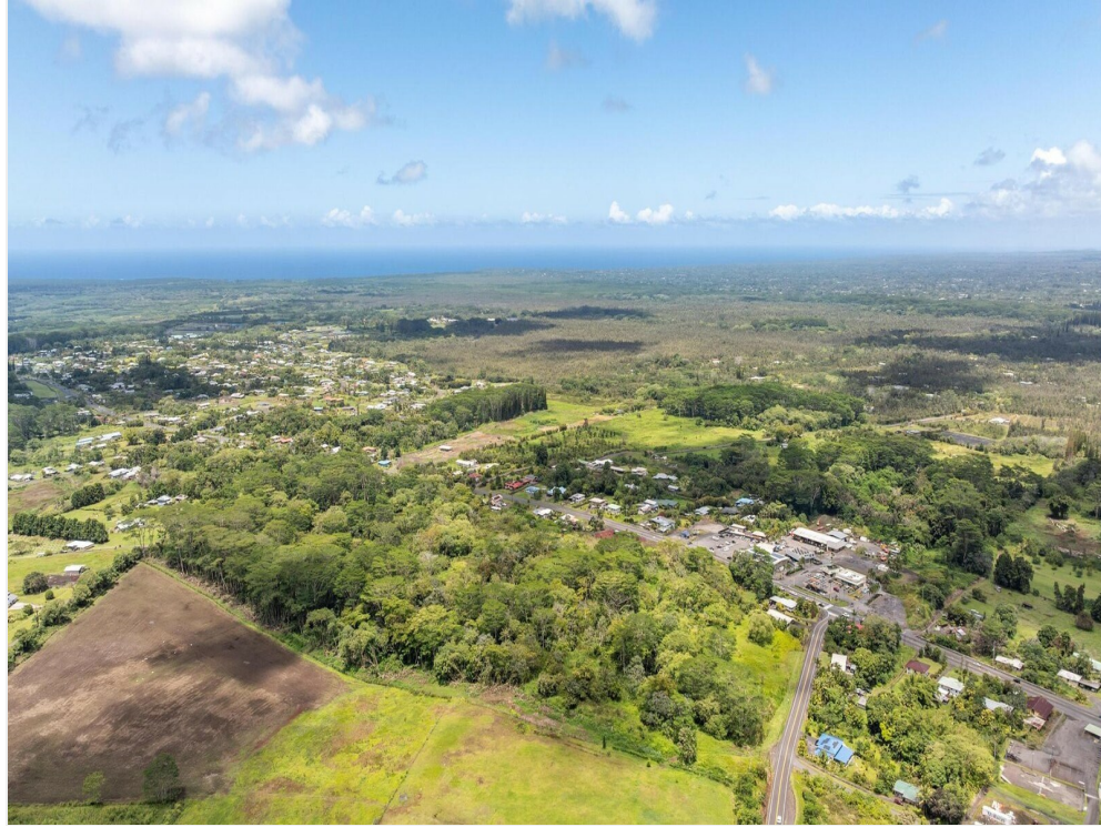
HELCO Power and High-Speed Internet Availability