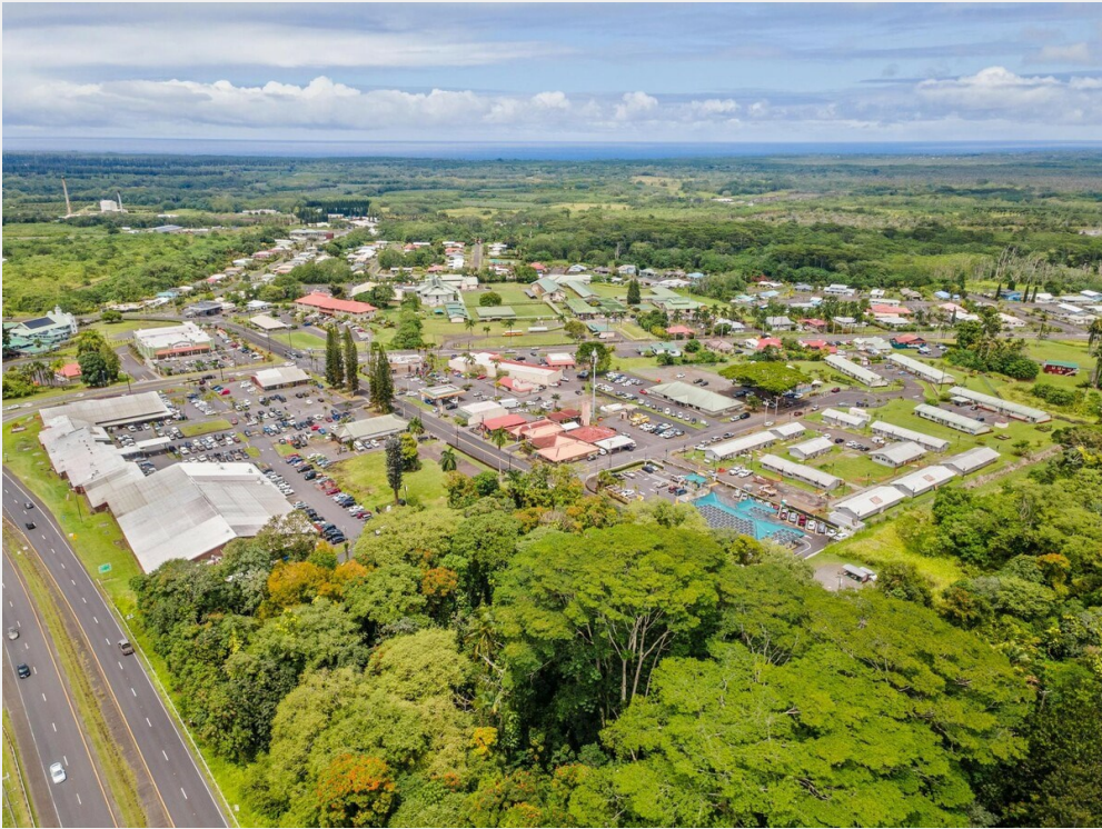
Just 9 Miles From Hilo