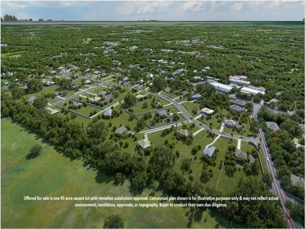
Vision For a Vibrant and Well-Integrated Neighborhood