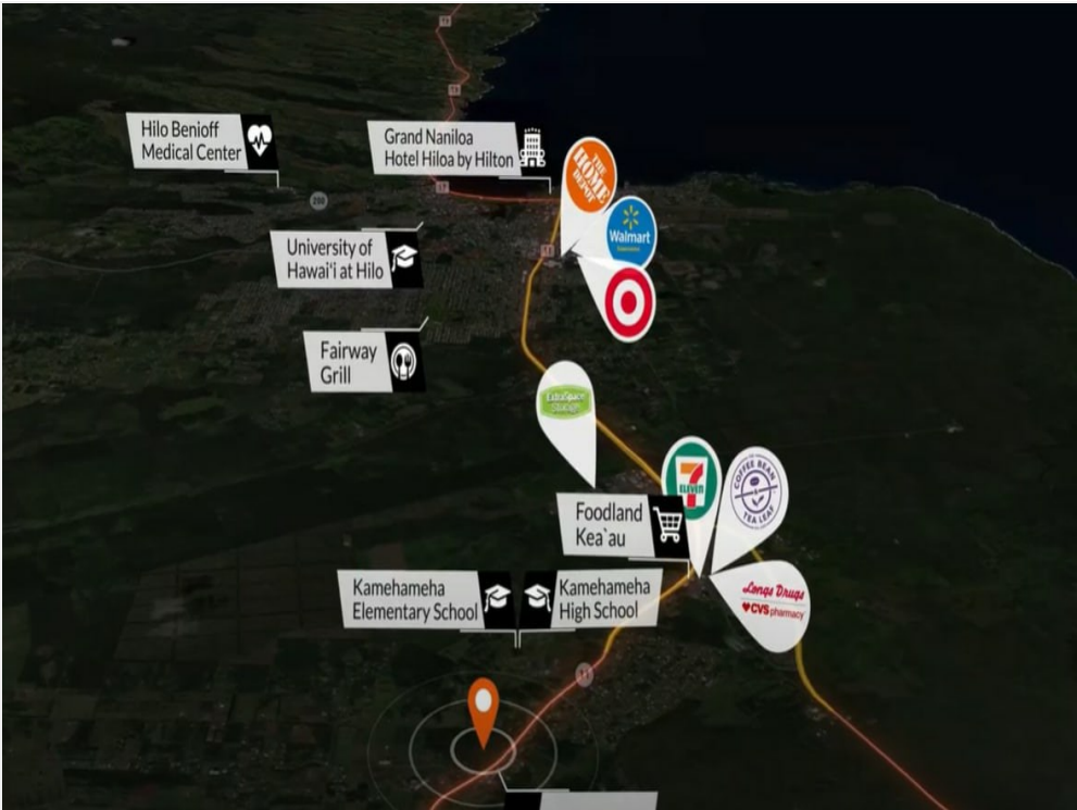
Near Huina Road