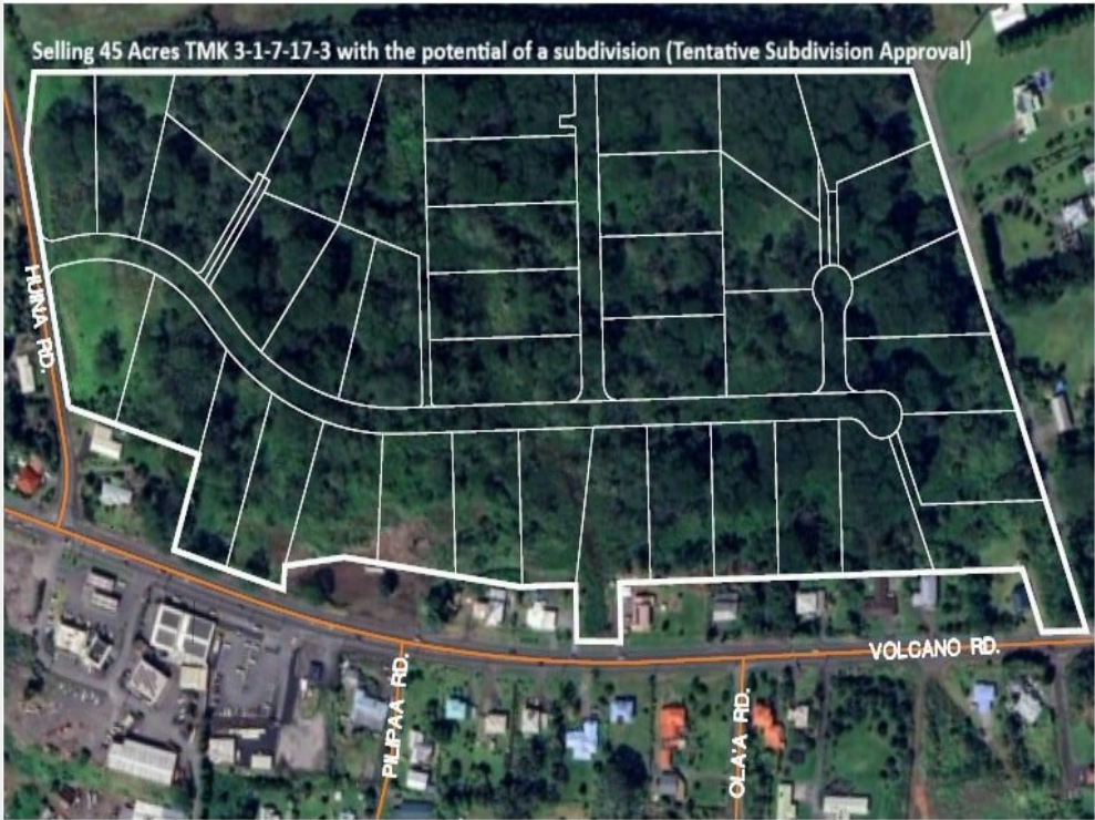
Tentative Subdivision Approval From Hawai'i County